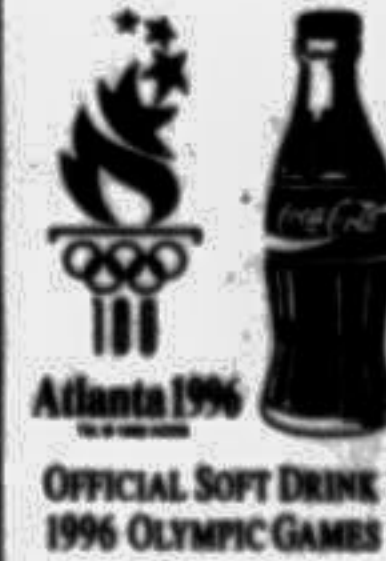
Atlanta 1996 OFFICIAL SOFT DRINK 1996 OLYMPIC GAMES