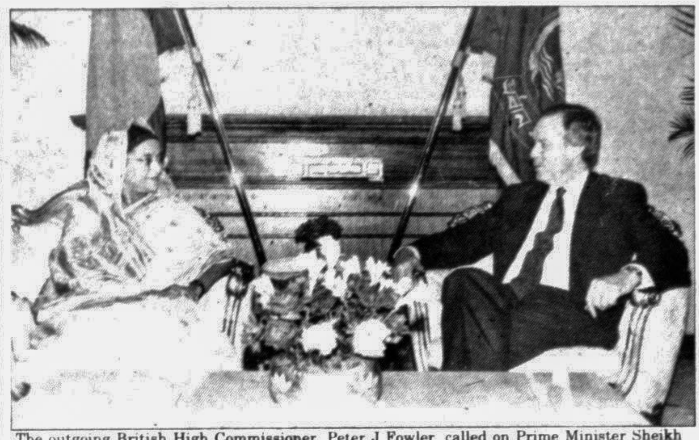
The outgoing British High Commissioner, Peter J. Fowler, called on Prime Minister Sheikh Hasina at her office yesterday.

From Page 7 priority sectors. Therefore, in order to revitalize this sector, I propose to reduce the duties on certain inputs used in this sector. Thus to facilitate supply of seed and fertilizer to the farmers at fair prices, I propose to reduce the duties on seed potatoes and gypsum anhydrite fertilizer from 7.5 percent to 2.5 percent.