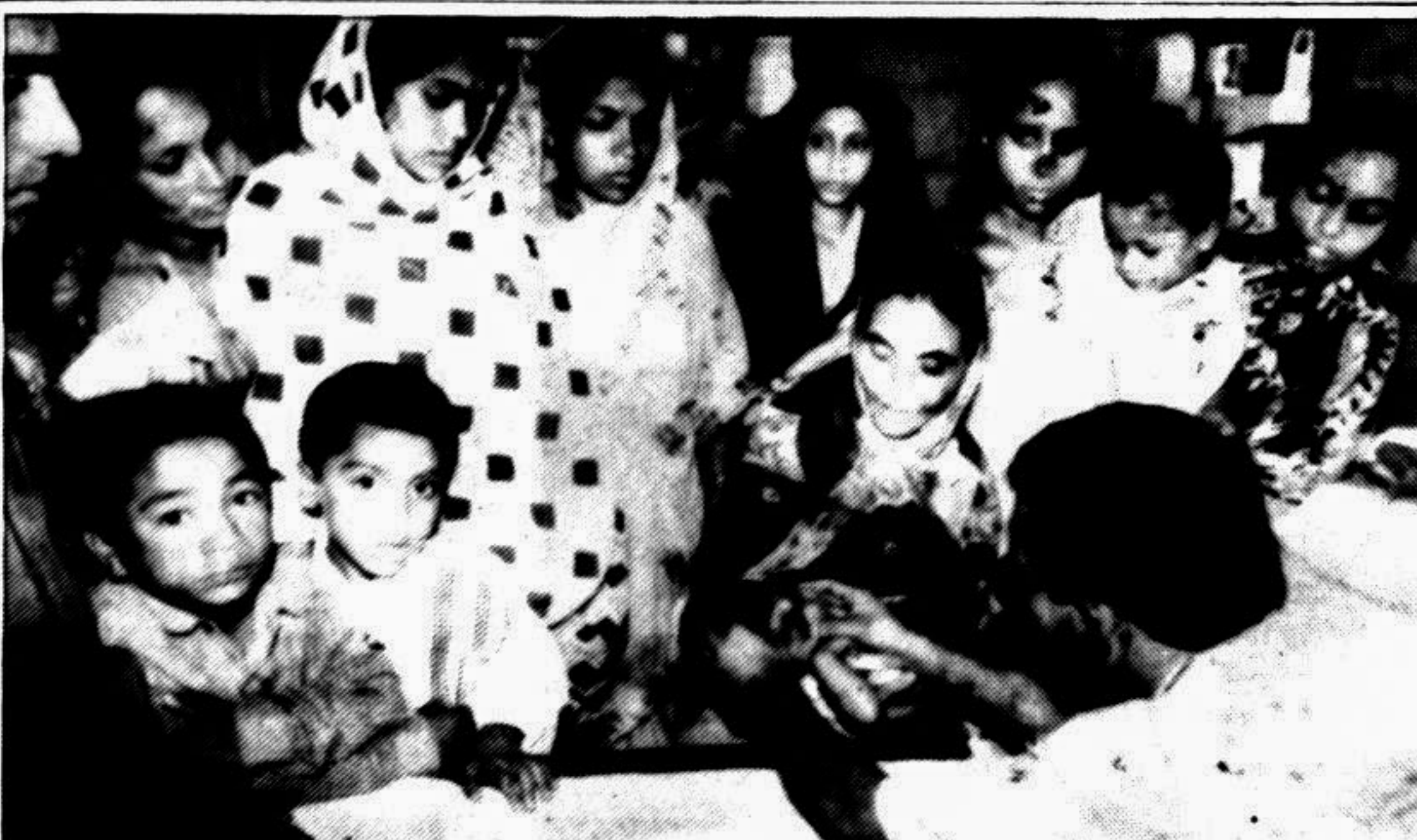
The number of doctors at the children's department of the Dhaka Medical College Hospital outdoor is too inadequate to cope up with the increasing number of patients.

The committee will submit its report to the Food Ministry within one month.