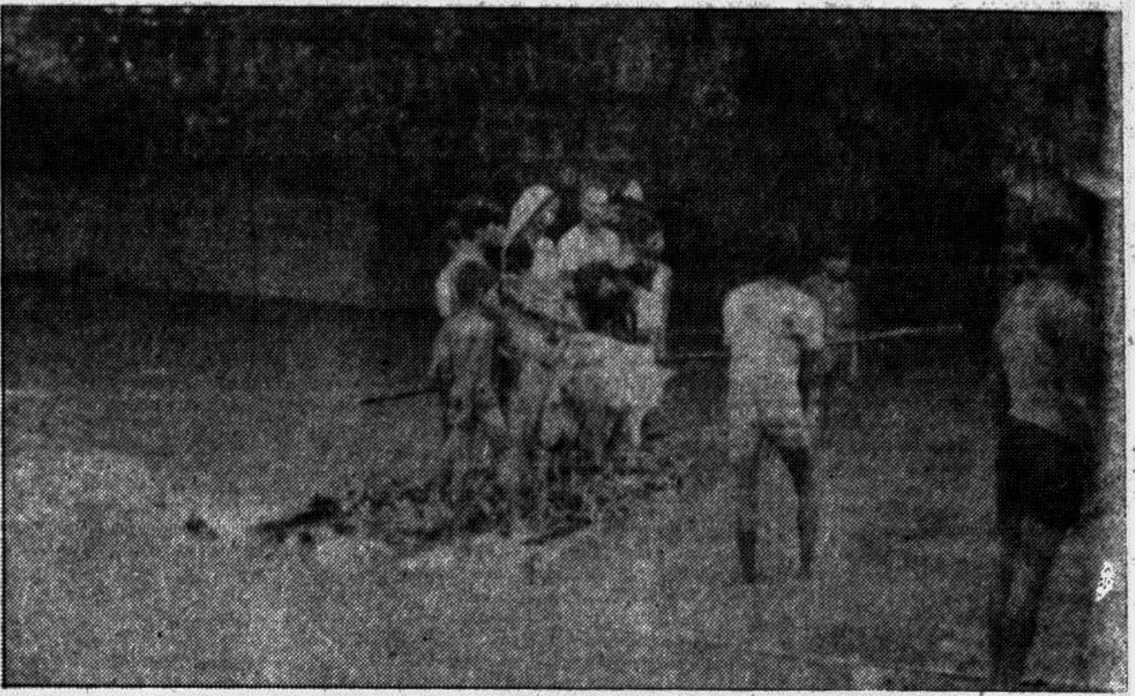
GAIBANDHA: Banana tree raft is the only means of transport in the flood affected Fulchari thana of the district.