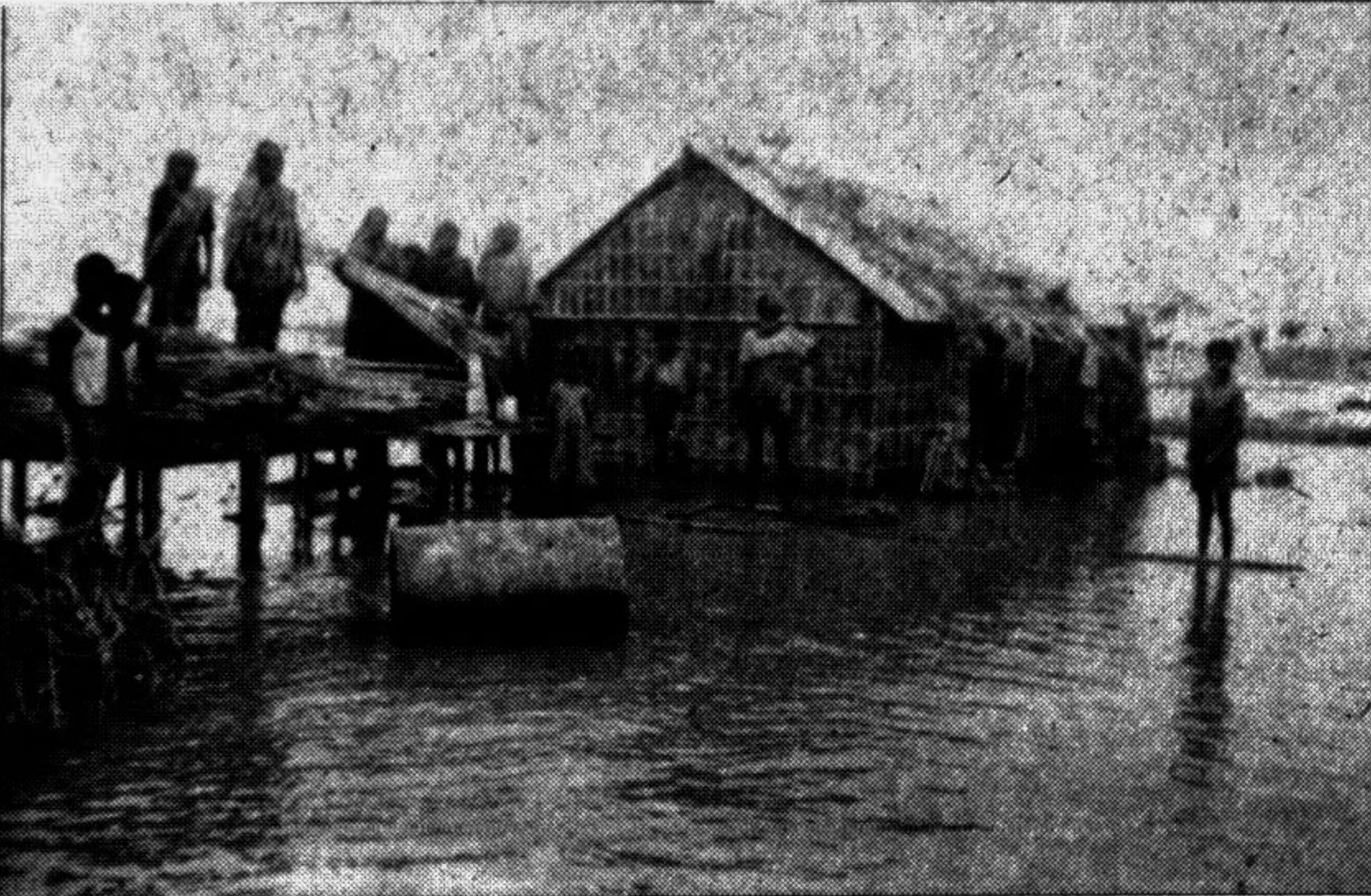
CHANDPUR: Flood affected people of Rajrajesar union under Chandpur thana.

According to Chandpur flood control office sources, badly affected areas are Taitala staff colony, Bishnudi Bank colony, Bhuiyan Bari road, Professor para road.