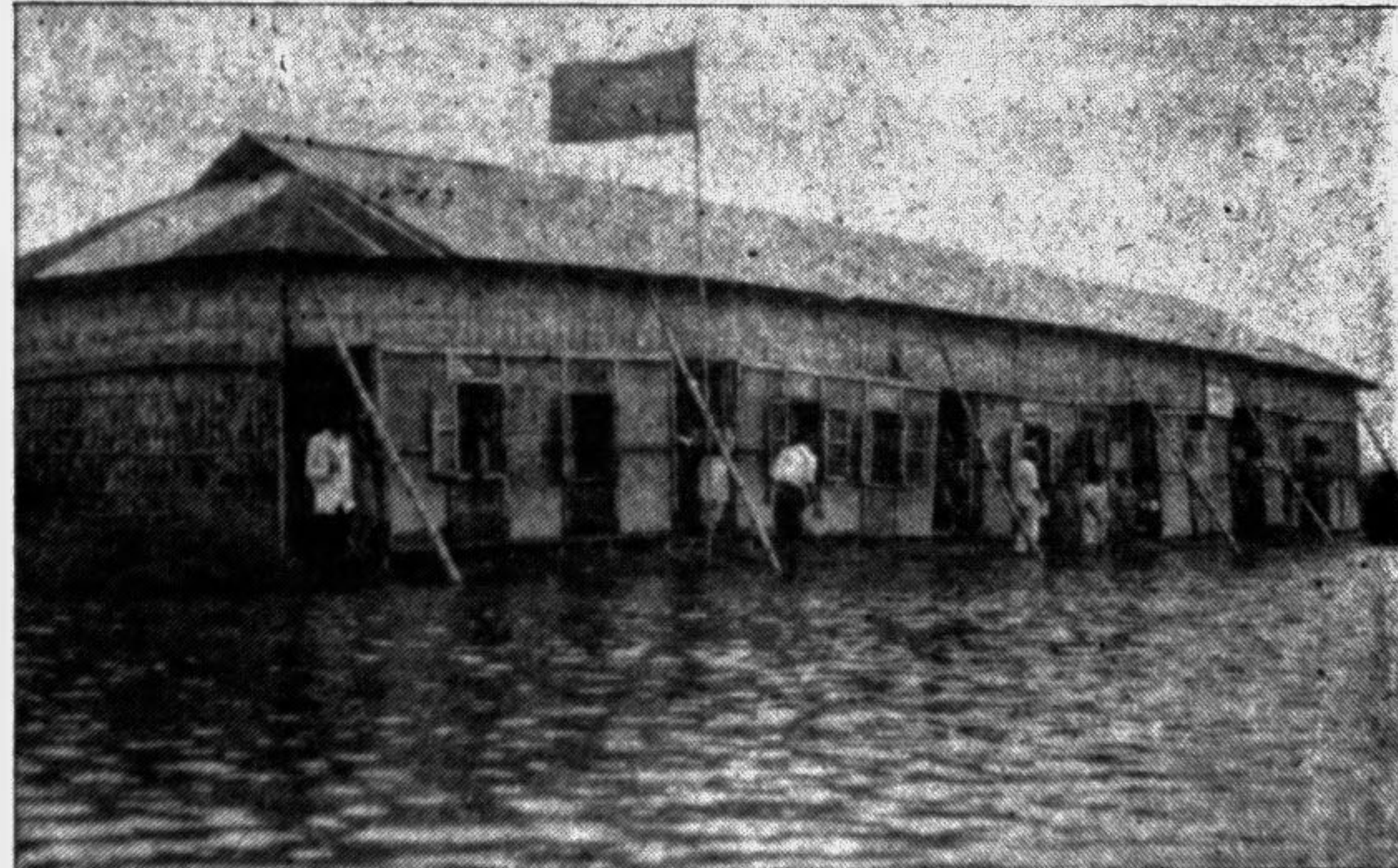
SHERPUR: Shahabdir Char Girls High School under Kamarer Char union hit by the recent flood.

BHOLA, July 26: About 1.50 lakh acres of land have been brought under transplanted aman cultivation in the district during the current season, reports UNB. District Agriculture Extension Department has taken up the programme with a production target of 2.76 lakh metric tons of paddy. Of the total, 53,200 acres have been brought under high yielding variety while the rest 1.02 lakh acres under local variety. Officials said about 500 demonstration plots have been set up in block level to acquaint the farmers with the modern methods of cultivation. Meanwhile, the farmers have been provided with loans, high yielding variety seeds and other necessary inputs to make the scheme a success.