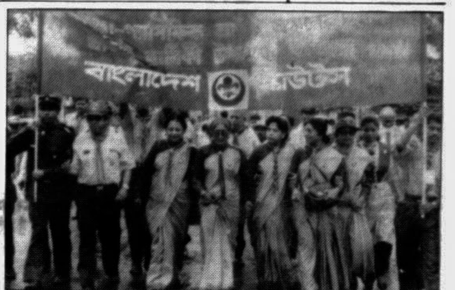
Members of Bangladesh Scouts organised a Walkathon in the city yesterday in observance of the 40th founding anniversary of Scouts, South Asia-Pacific region.