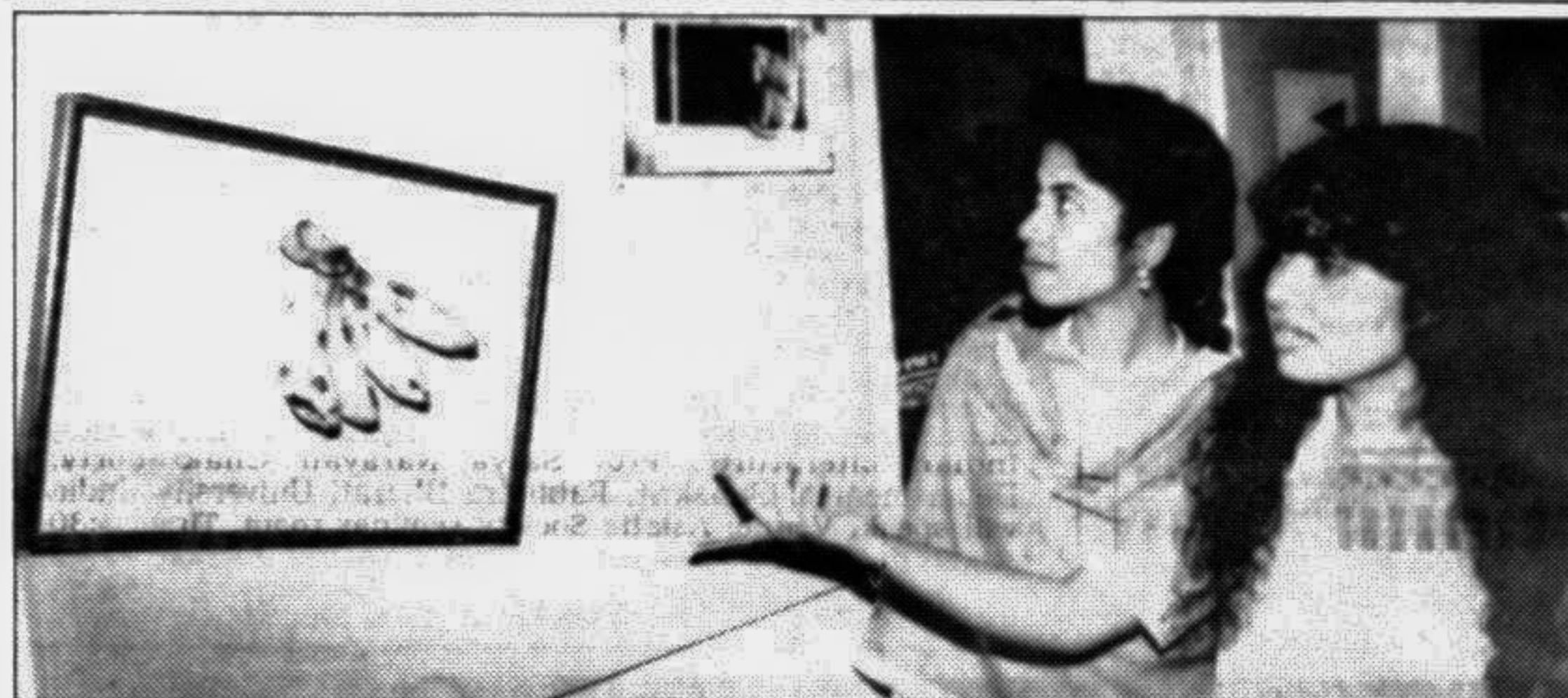
Visitors at an exhibition of photographs entitled 'New Way' by eight photographers at the Gallery Tone in the city yesterday.