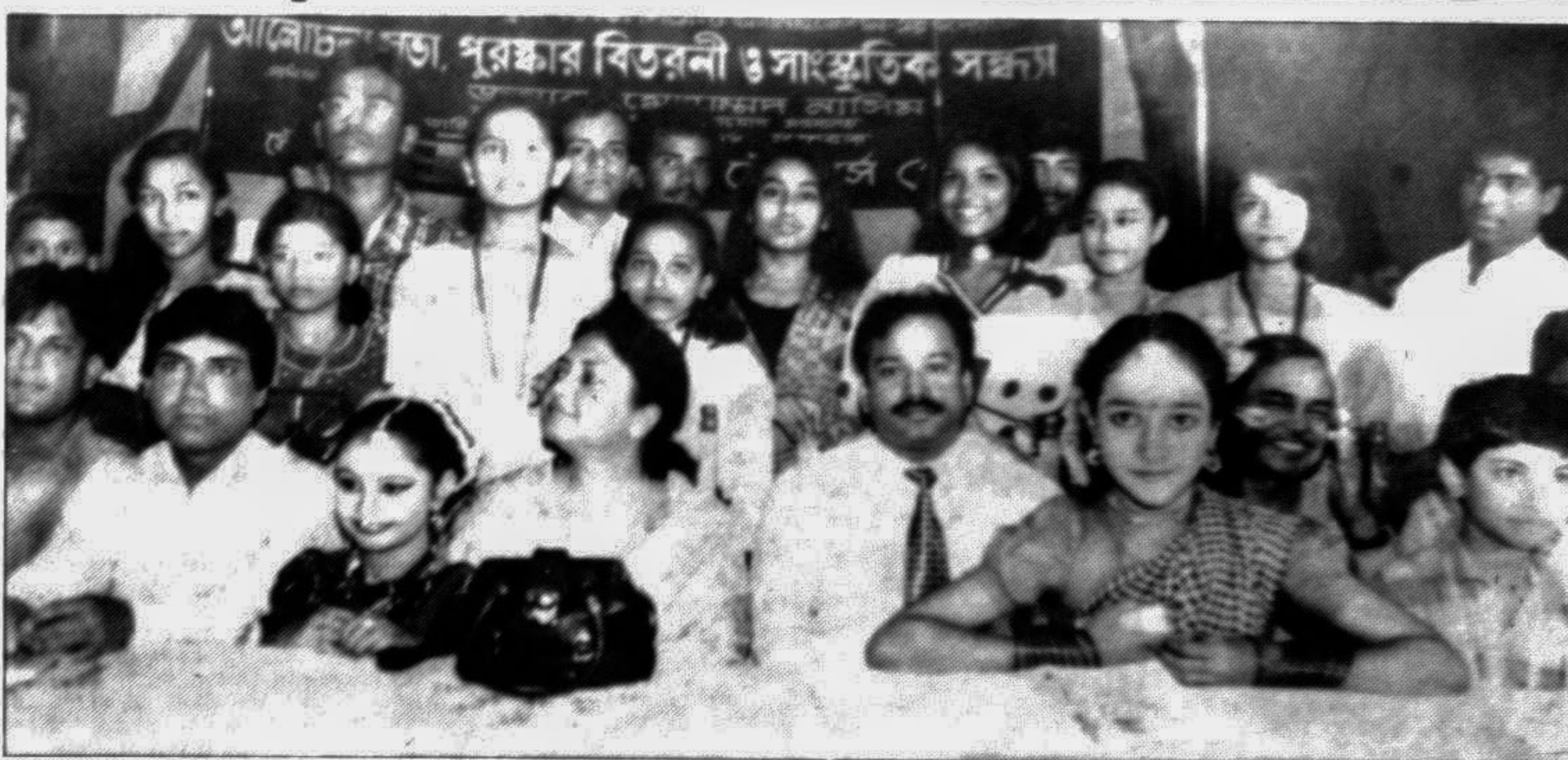
Prize winners pose for photograph with the invited guests at an award ceremony organised by Youth and Children's Development Organisation in the city yesterday.