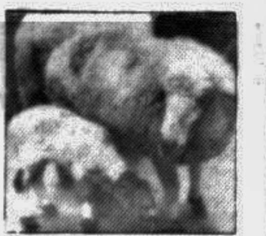
Animal's Contribution to Medical Treatment Page 3