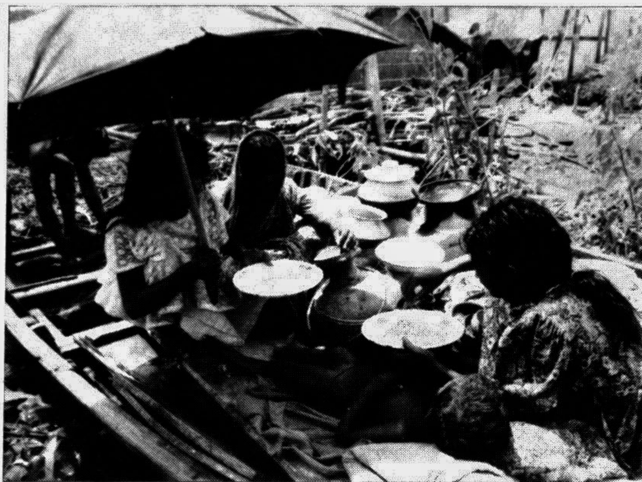
A family on a boat with its belongings in flood-hit Lauhajong thana of Munshiganj district.

NEW DELHI, July 26: Seven people died and at least 10 were trapped under debris today when a two-storey building on to which workers were adding two more floors collapsed in South Delhi, rescue officials said.