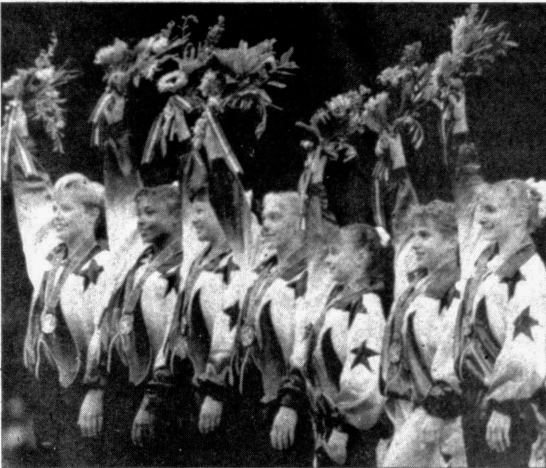
SUPERB SEVEN: The victorious US gymnastics team waves to the audience from the podium at the Georgia Dome in Atlanta on July 23.