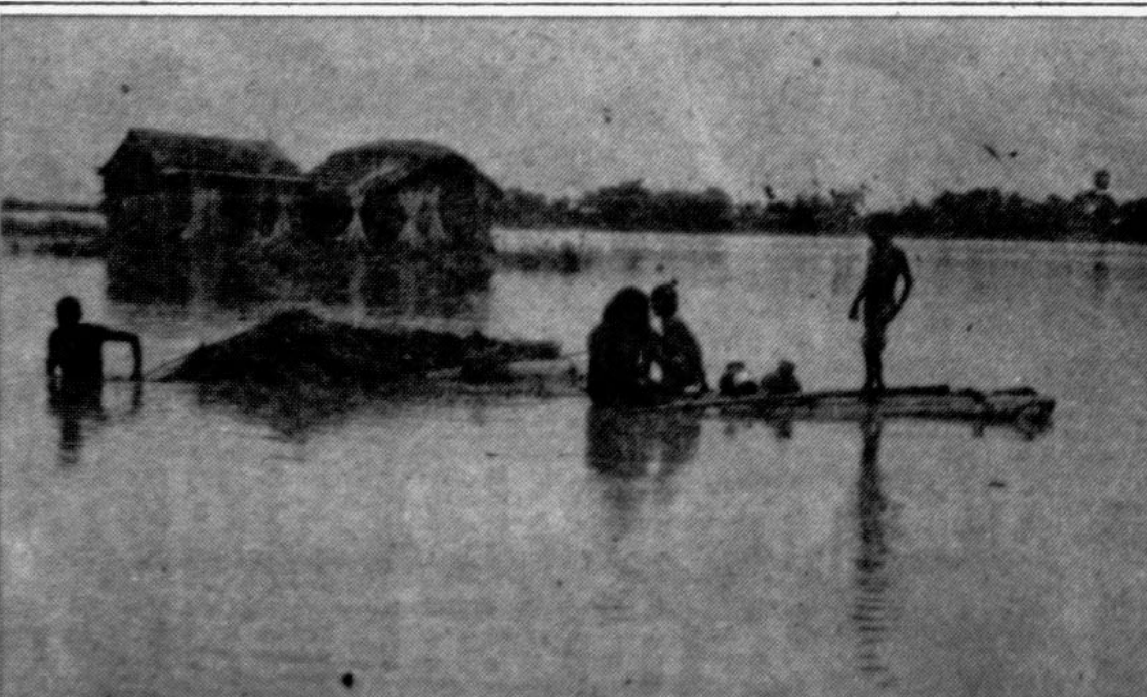
SHERPUR: Picture taken from low-lying areas of Chandrakuna union under Nakla thana.

The distressed people urged the government to provide them with adequate relief and take necessary steps for their early rehabilitation by sanctioning house building materials and grants.