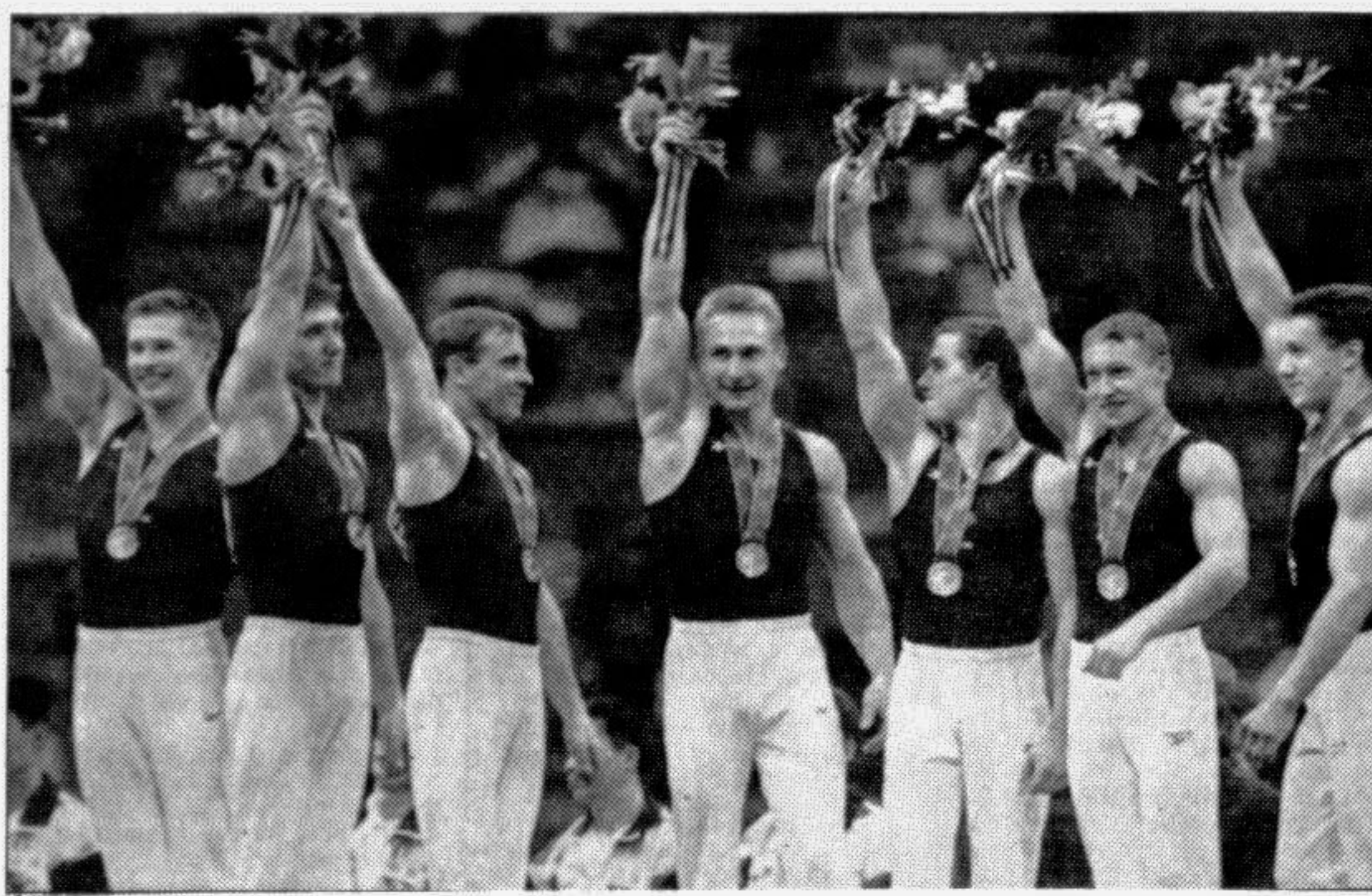
SUPERB SEVEN: Russian gymnastic team acknowledging crowds' cheers after claiming the gold in the event at the Georgia Dome, Atlanta, on July 22.