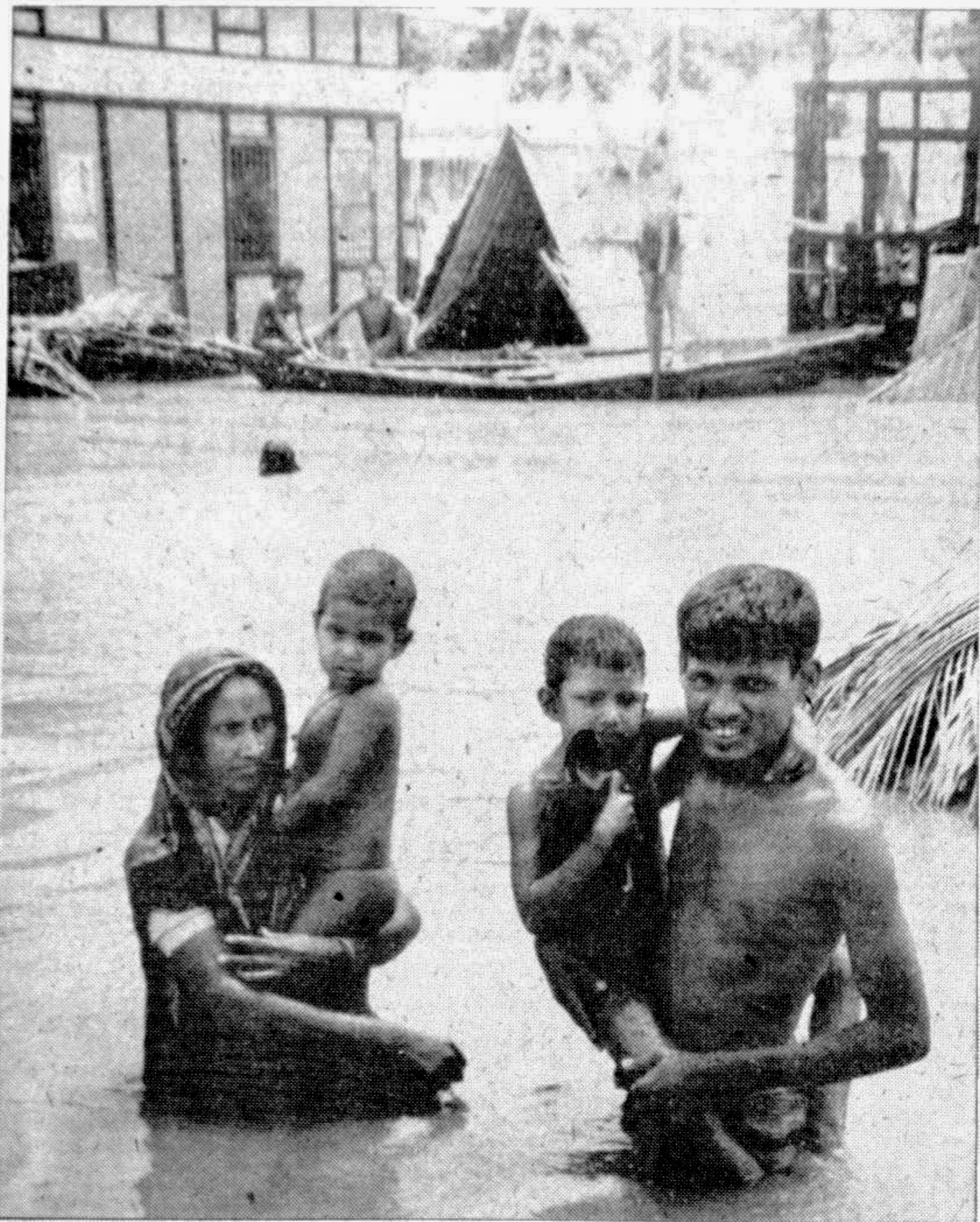
MUNSHIGANJ. Flood waters forces many erosion-hit victims in Nurpur village to move to safer place in Louhajang Thana of the district.