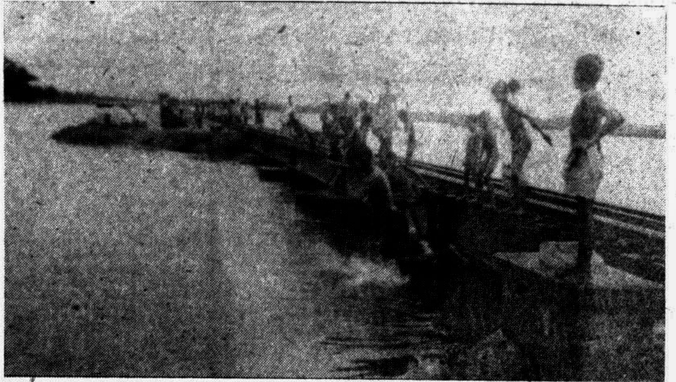
GAIBANDHA: Young boys diving in the flood waters near outer signal of Gaibandha railway station. Many parts of the railway line remain submerged affecting train communications in the district. This photo was taken on Sunday.

An amount of Taka 1,91,27,187 was earned from the private parties and individuals against supply of bamboos and sale proceeds of seized forest products through open auction while another amount of Tk 8,22,740 was received from the Karnaphuli Paper Mills Limited against supply of bamboos during 1995-96, the DFO added.