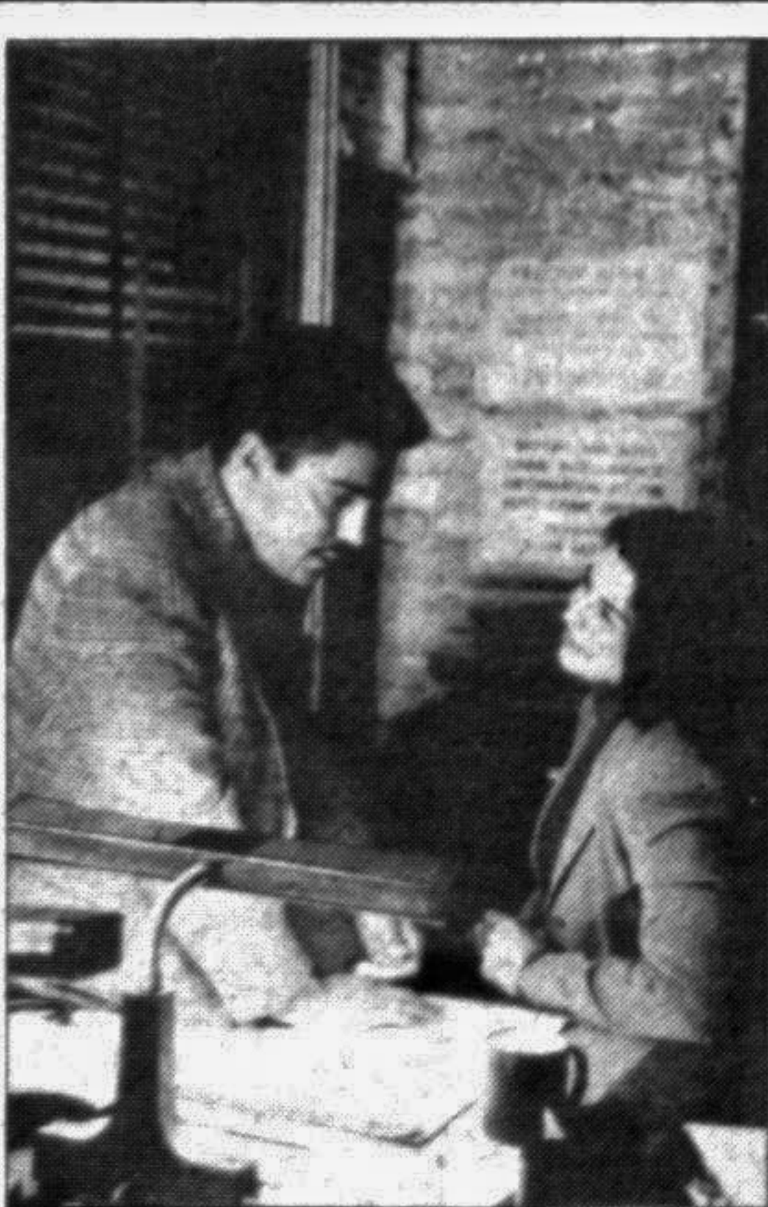
NYPD Blue on Star Plus, Tonight at 9:30

6:30am Voltan 7:00 Teenage Mutant Ninja Turtles 7:30 GI Joe 8:00 Saber Rider and The Star Sheriff 8:30 The Adventures Of Black Beauty 9:00 Aerobics Of Style 9:30 Nanny and the Profes 10:00 Mr. Belvedere 10:30 Graham Kerr's Kitchen 11:00 El Extreme Close Up Thierry Lhermitte 11:30 Gabrielle 12:30 Santa Barbara 1:30 The Bold & The Beautiful 2:00 The Oprah Winfrey Show 3:00 Remington Steele 4:00 Graham Kerr's Kitchen 4:30 El Extreme Close Up Thierry Lhermitte 5:00 Teenage Mutant Ninja Turtles 5:30 The Adventures Of Black Beauty 6:00pm Lost in Space 7:00 Home and Away 7:30 Charles in Charge 8:00 MASH 8:30 The Golden Girls 9:00 Empty Nest 9:30 NYPD Blue 10:30 The Bold & The Beautiful 11:00 Santa Barbara 12:00am The New Ten