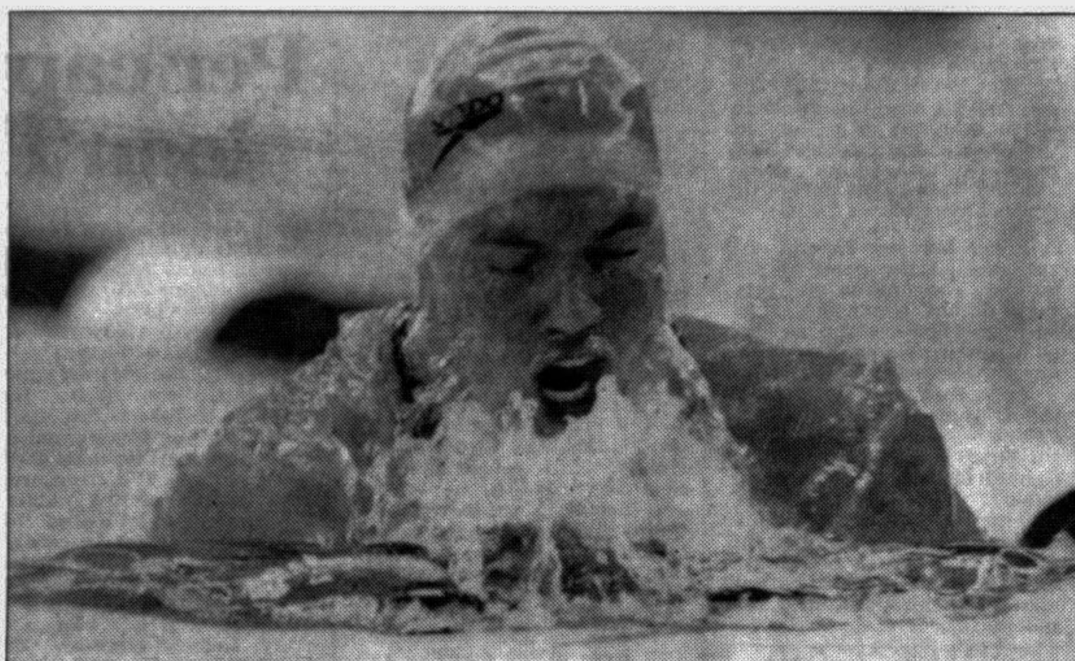
Penny Heyns of South Africa paddles her way to win the 100m breaststroke with a new world record. The 21-year-old clocked one minute 07.02 seconds.

Shooting Men's 50-metre free pistol 7.00 pm: Qualifying 10.00 pm: Finals Women's double trap 7.00 pm: Qualifying 12.30 am (Wednesday): Finals.