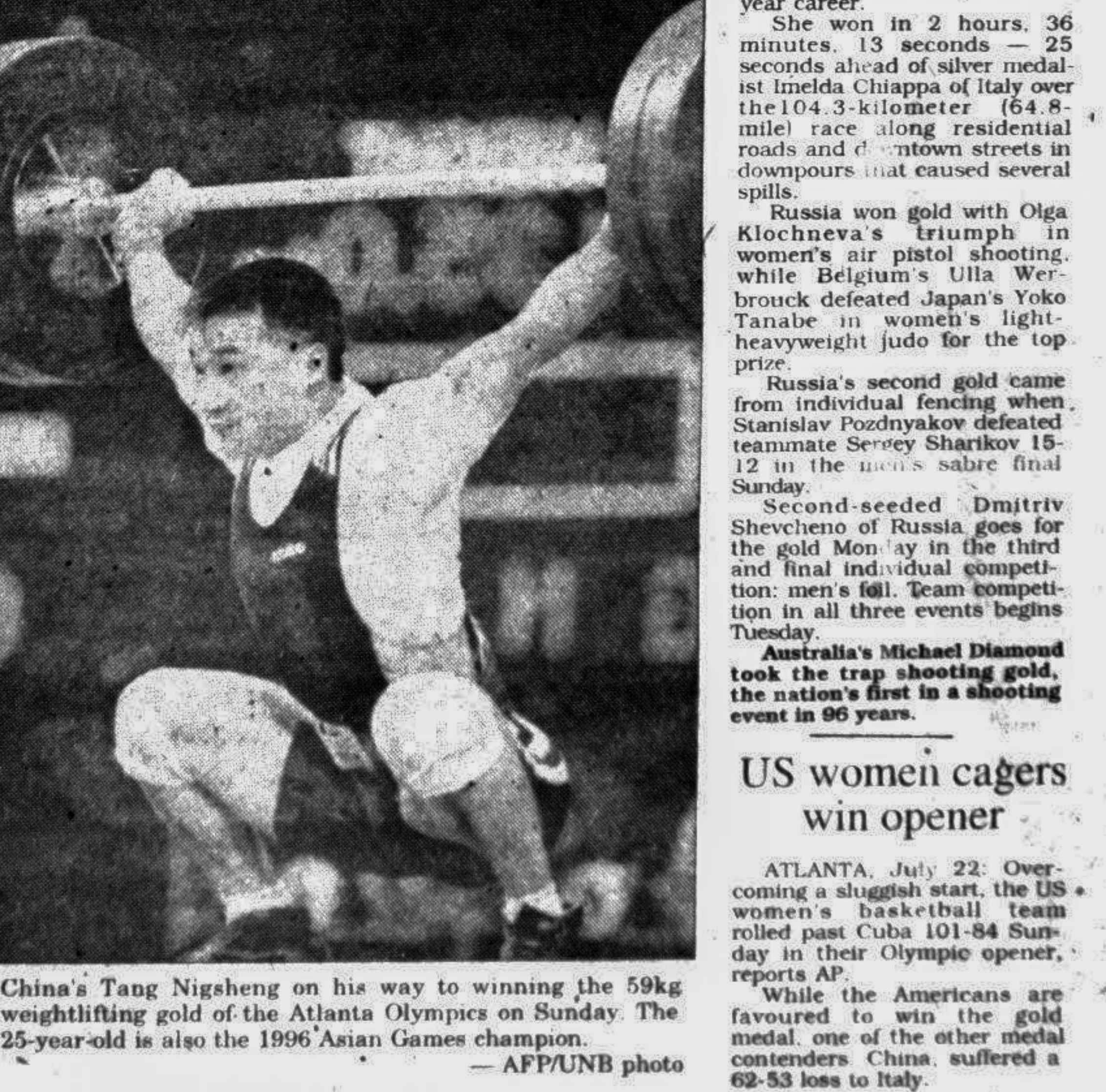
China's Tang Ningsheng on his way to winning the 59kg weightlifting gold of the Atlanta Olympics on Sunday. The 25-year-old is also the 1996 Asian Games champion.

Australia's Michael Diamond took the trap shooting gold, the nation's first in a shooting event in 96 years.