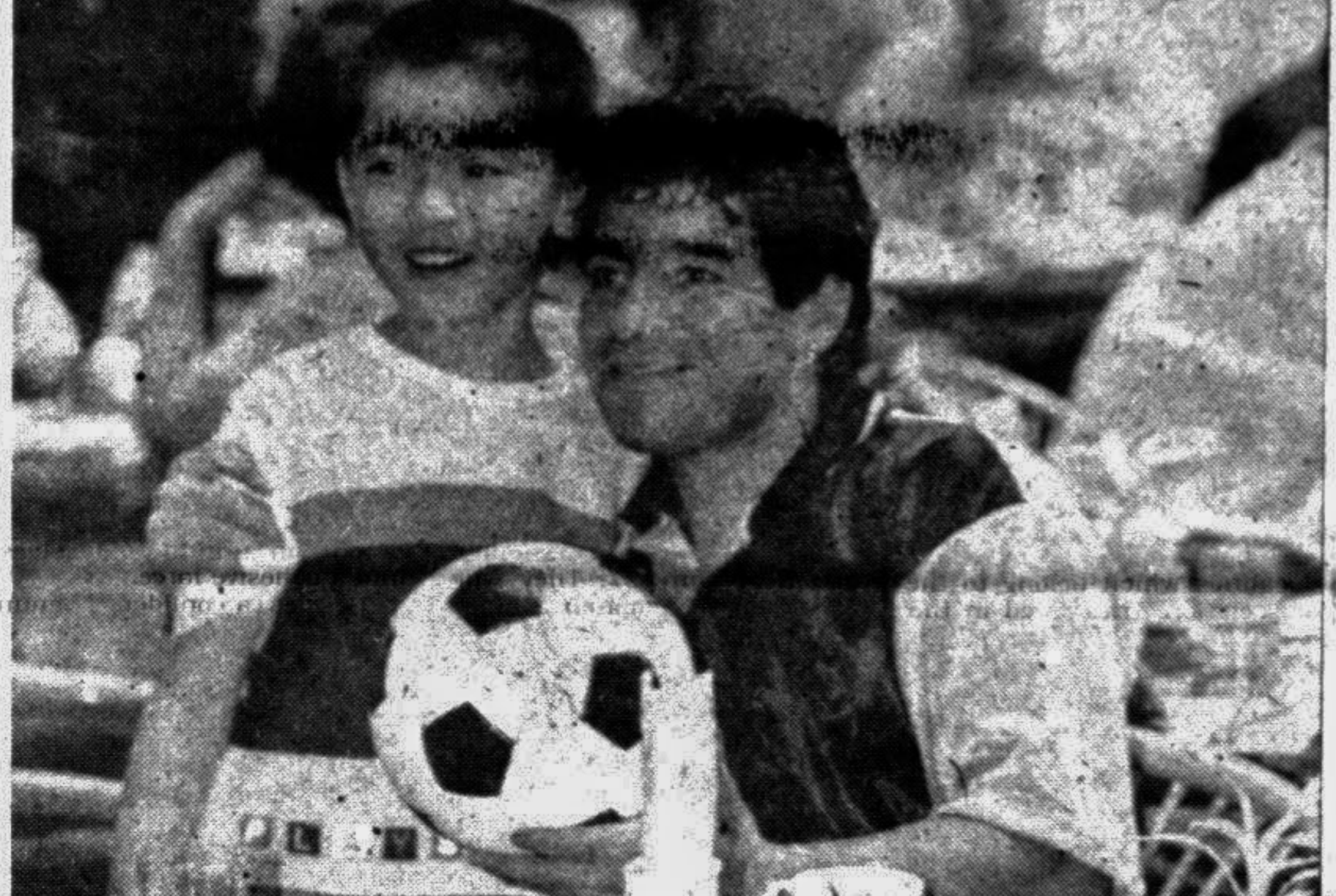
Argentine superstar Diego Maradona with a Chinese kid at a hotel in Beijing on July 22. The soccer idol of millions is now in this part of the world along with his team Boca Juniors on a week-long tour.