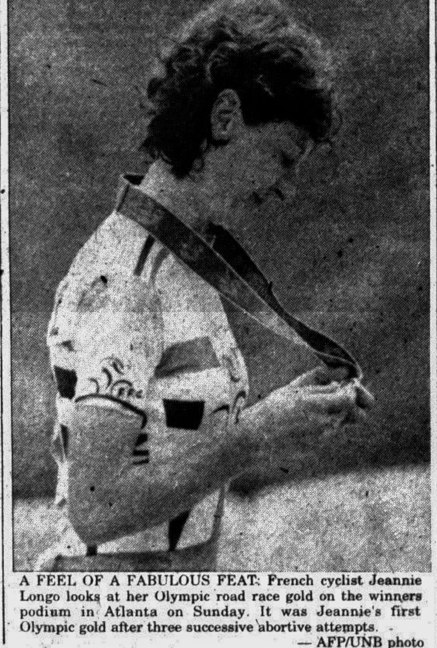
A FEEL OF A FABULOUS FEAT: French cyclist Jeannie Longo looks at her Olympic road race gold on the winners podium in Atlanta on Sunday. It was Jeannie's first Olympic gold after three successive abortive attempts.