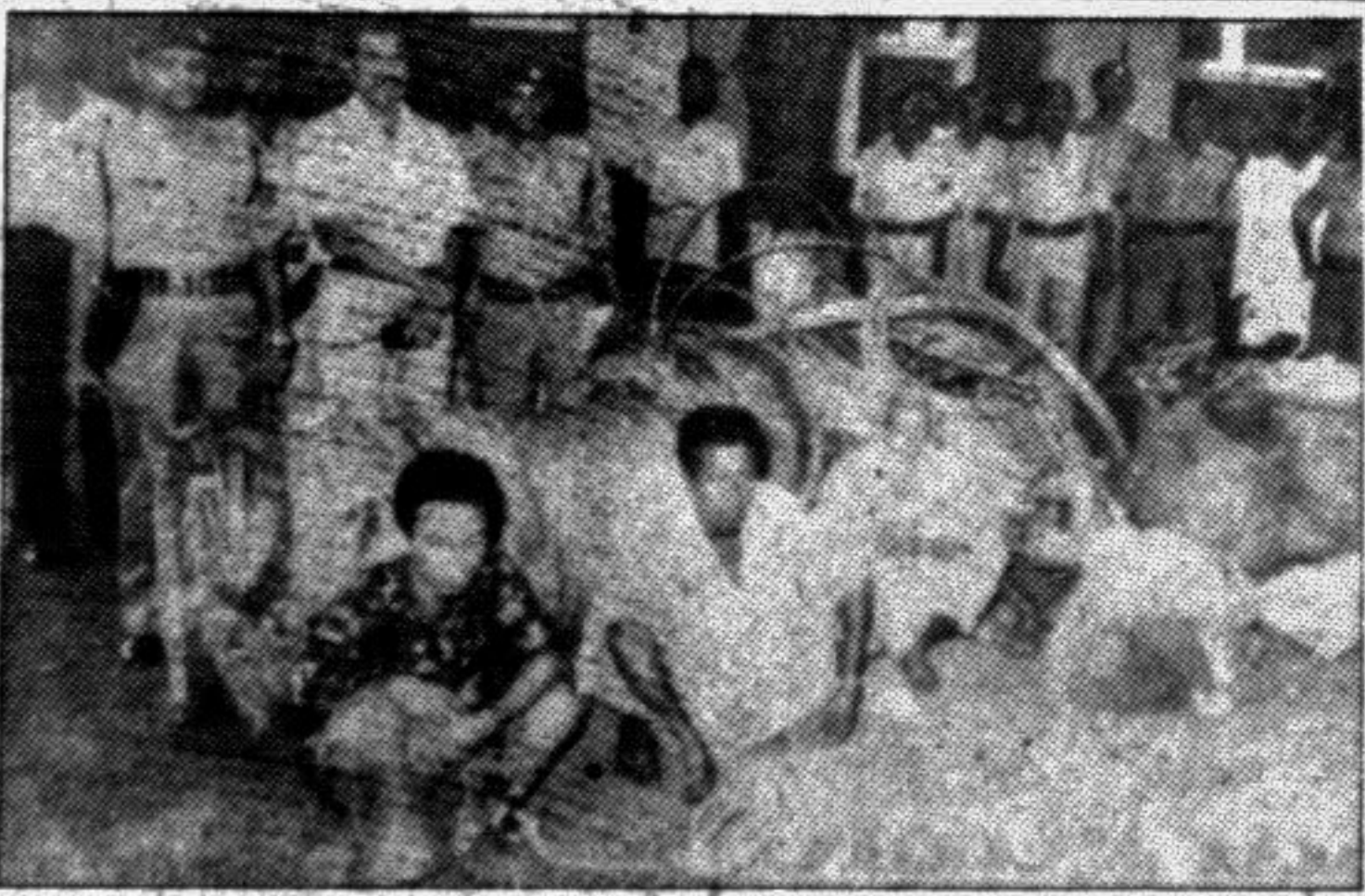
RAJSHAHI: Shah Mokhdum thana police recently discovered an illegal aluminium factory in the city and recovered materials including stolen aluminium wire used by the Palli Bidyut Samities worth about Tk 5 lakh. Police also arrested three persons in this connection.