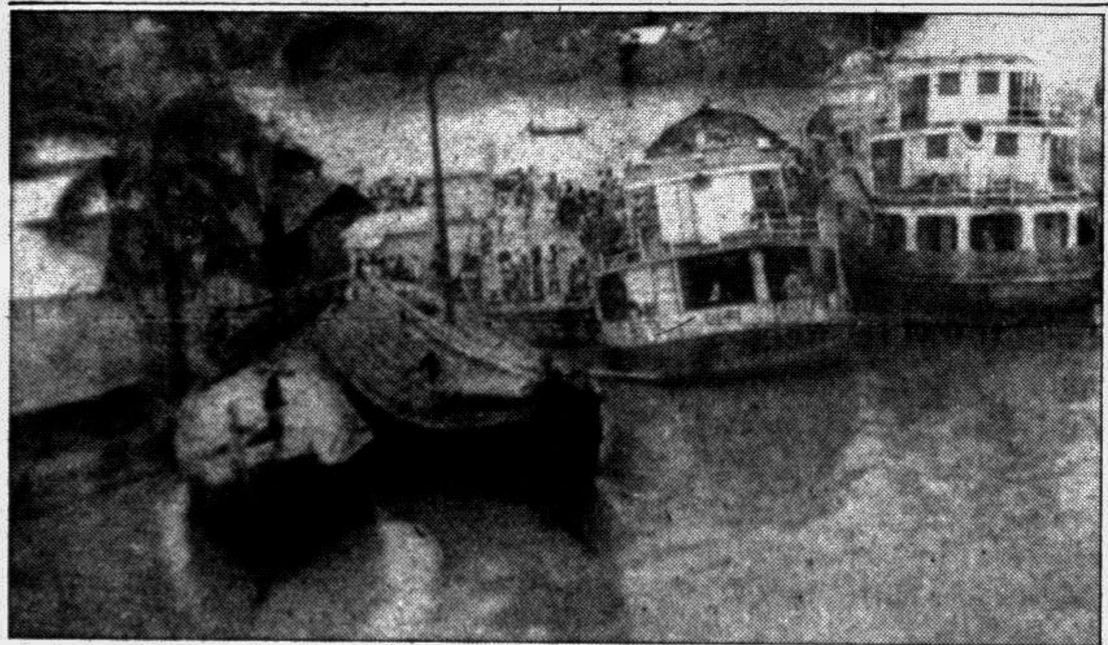
PABNA: Nagarbari ferry ghat literally experienced inundation by the river Jamuna causing docking problems.