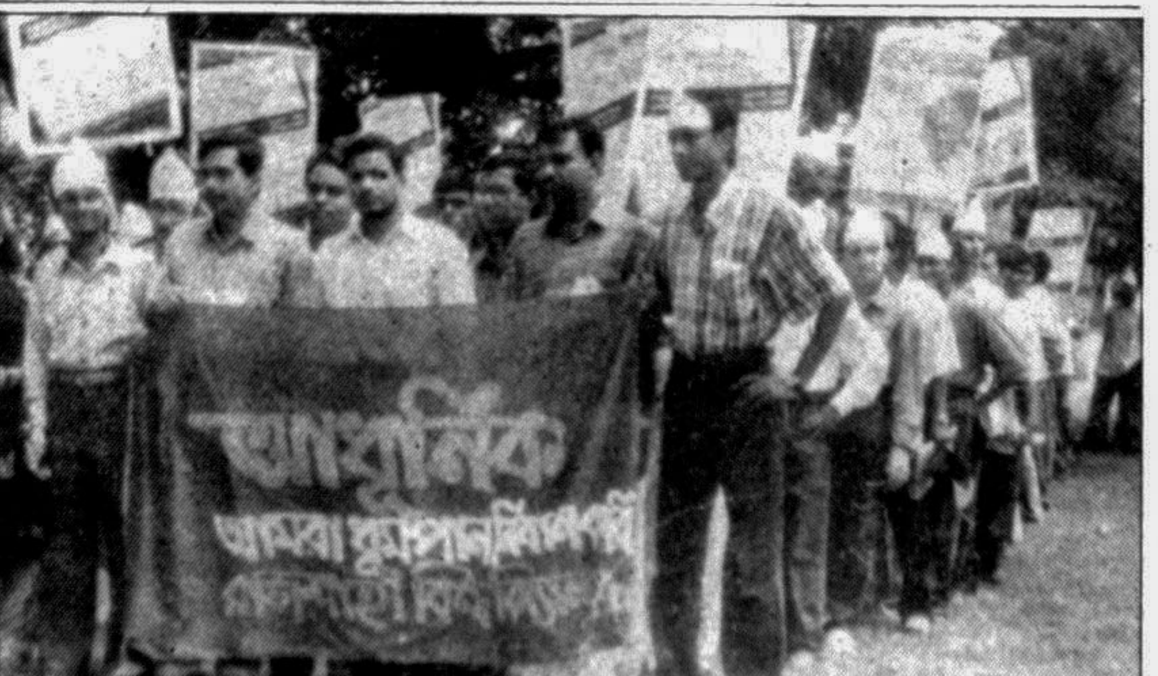
RAJSHAHI UNIVERSITY: Adhunik, an anti-smoking organisation brought out a procession in the campus promoting alertness against tobacco and drugs recently.