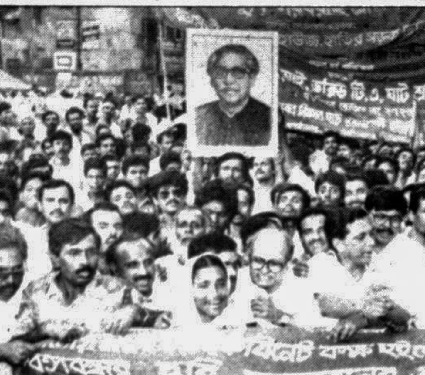
The Bangladesh Awami Krishak League brought out a procession in the city yesterday to protest the removal of a portrait of Bangabandhu Sheikh Mujibur Rahman from the Cabinet Room of the Jatiya Sangsad recently.