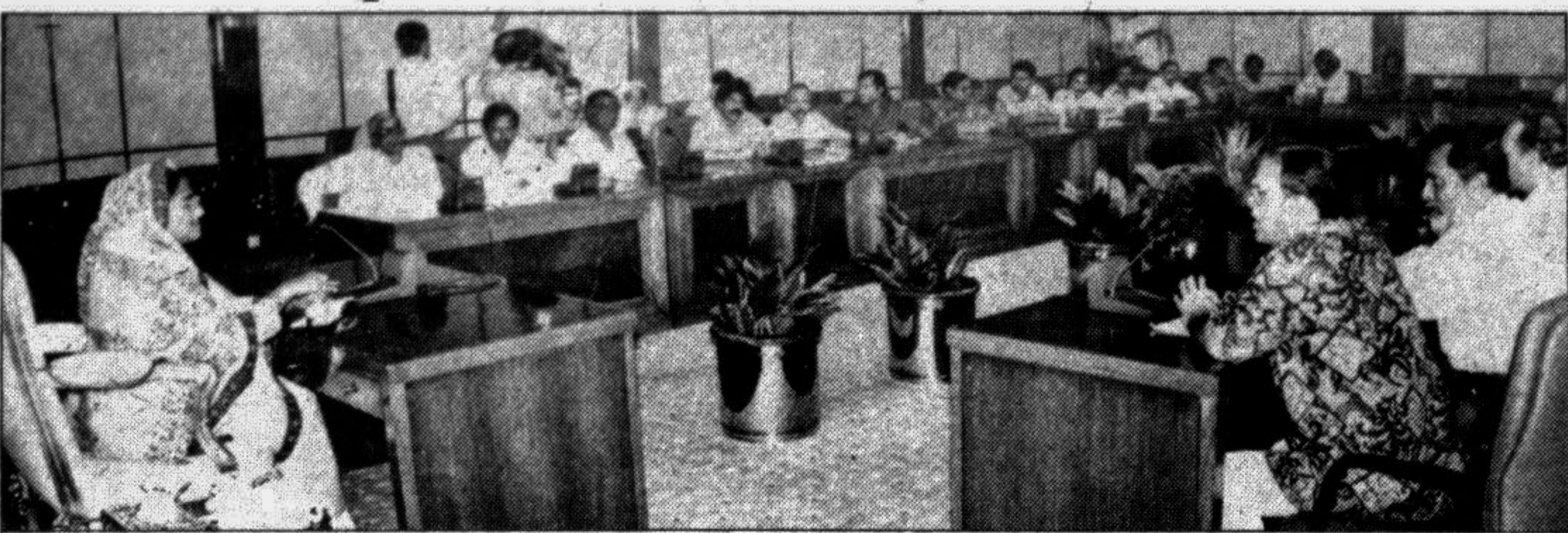
Prime Minister Sheikh Hasina addressing a delegation of Bangladesh Federal Union of Journalists at her office in city yesterday.