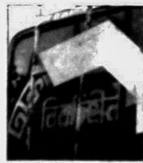
Eccentric Bus Ride Page 3