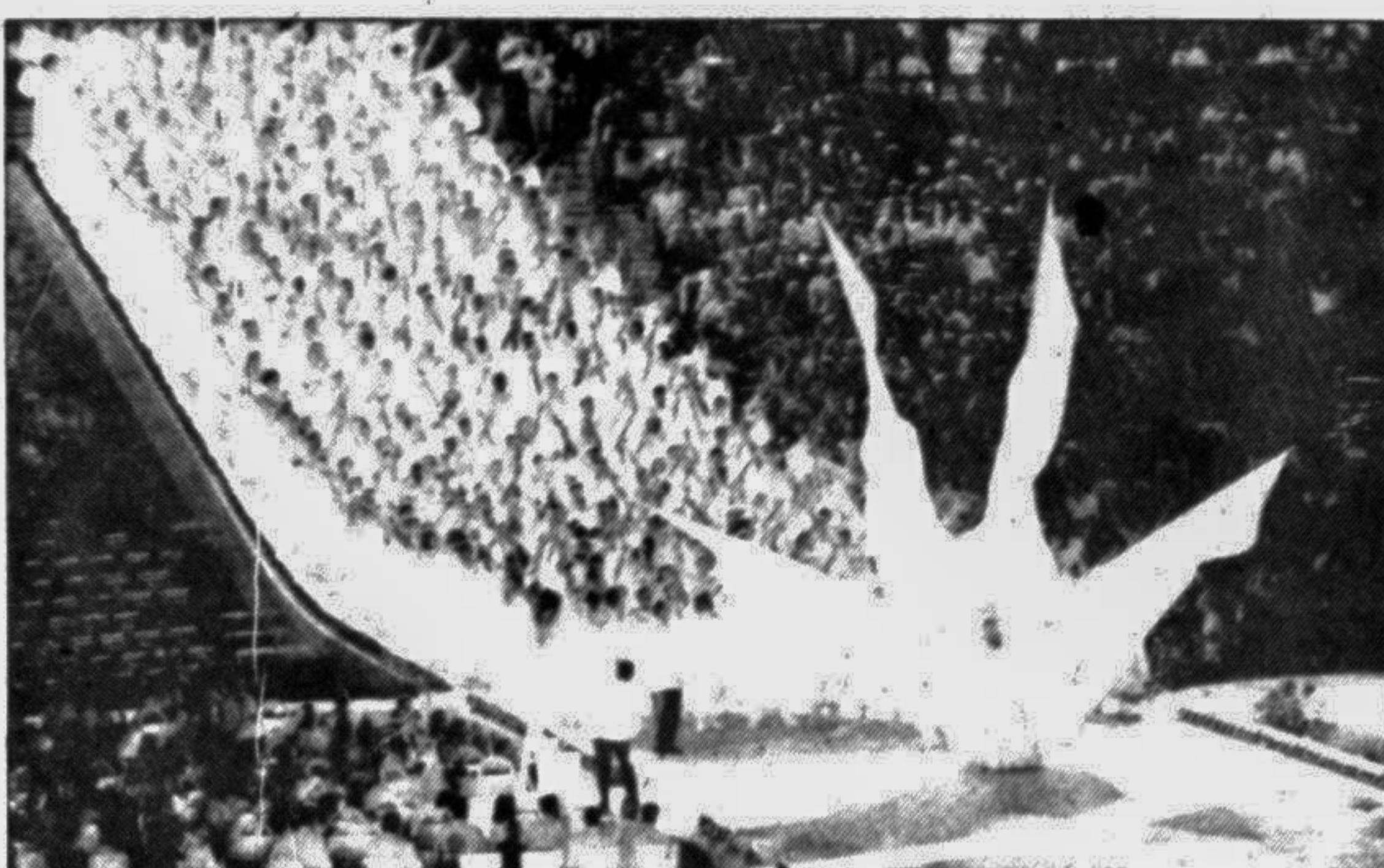
FAIR LADIES ON A FAIRY-TALE SHOW: Performers display their calisthenic at the grandiose opening gala of the Centennial Olympiad that kicked off in Atlanta on July 19.

But many associates of Samaranch, a skilful but controversial leader of the Olympic Movement since 1980, are confident he will stand again and that if he does, his re-election will be a formality.