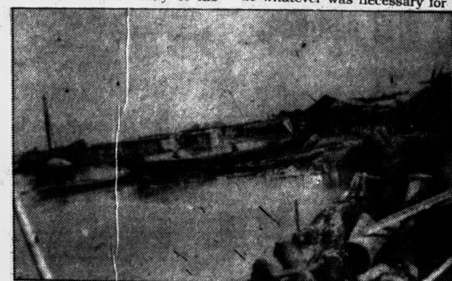
PABNA: The devoured and deserted scene of Nakalia Bazar in Bera thana caused by severe Jamuna erosion.