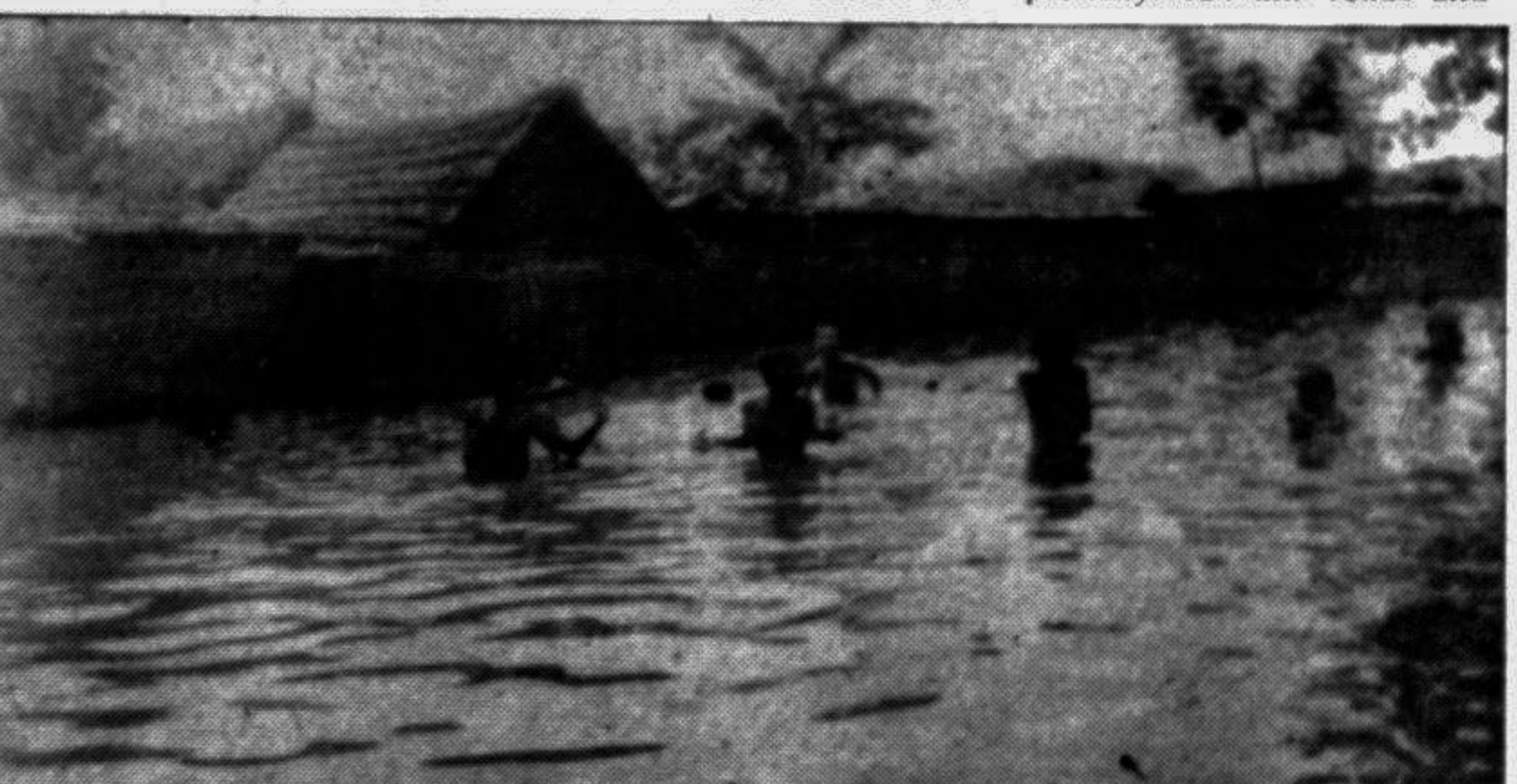
GAIBANDHA: Portion of Kalibaripar under Gaibandha Pourashaba remain under waist deep water.

1,97,500 people have directly been affected by flood water. Of them badly affected are 29,632 families. Total 7,400 dwelling houses were damaged completely and 13,500 affected partially. 324 km. roads and