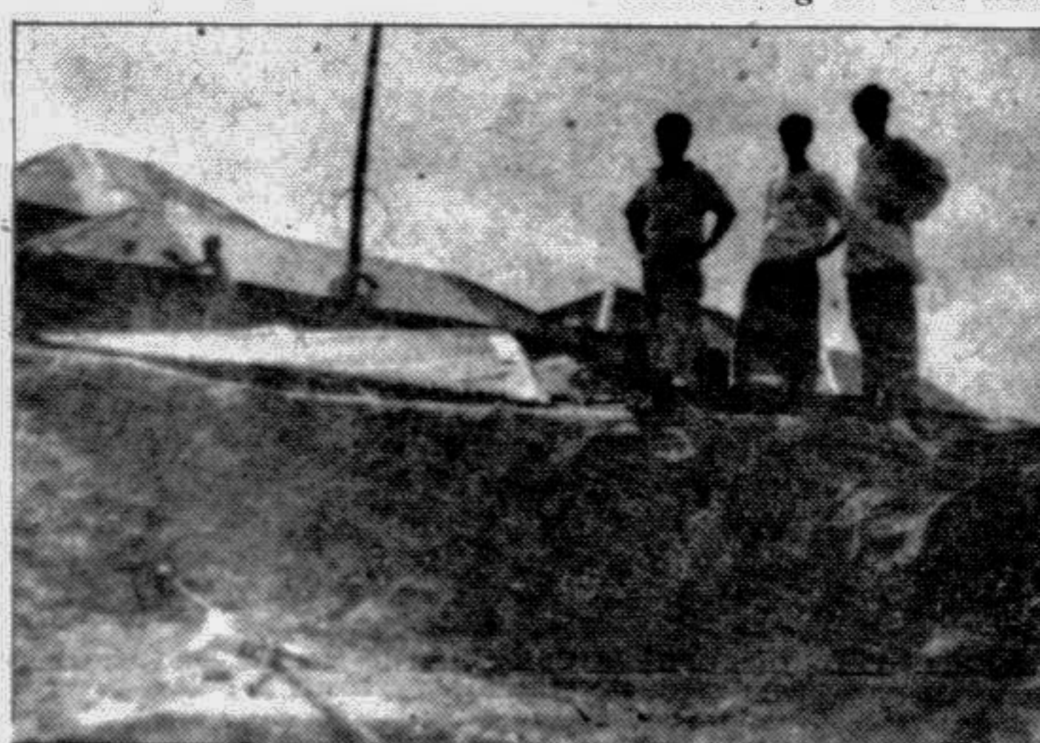
PABNA: The wreckage of Pechakhola Bazar, eroded by Jamuna, where people are hurriedly removing their shops to safer place.

The Executive Engineer admitted that in spite of the above step taken by them, there was a grave threat to