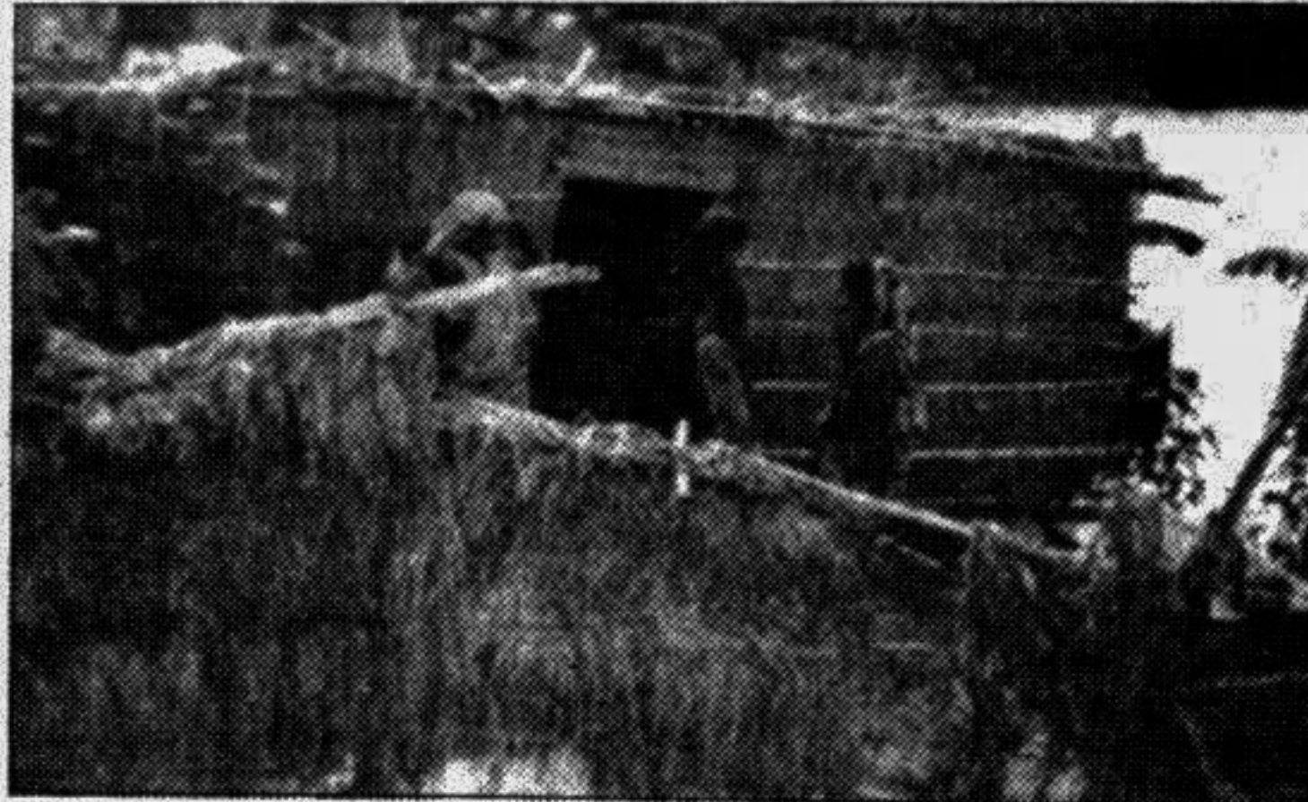
PABNA: The helpless village women from a erosion-devoured village under Bera thana, took shelter upon flood control embankment, but again faced threat of the same disaster as erosion already approached near their temporary shelter.