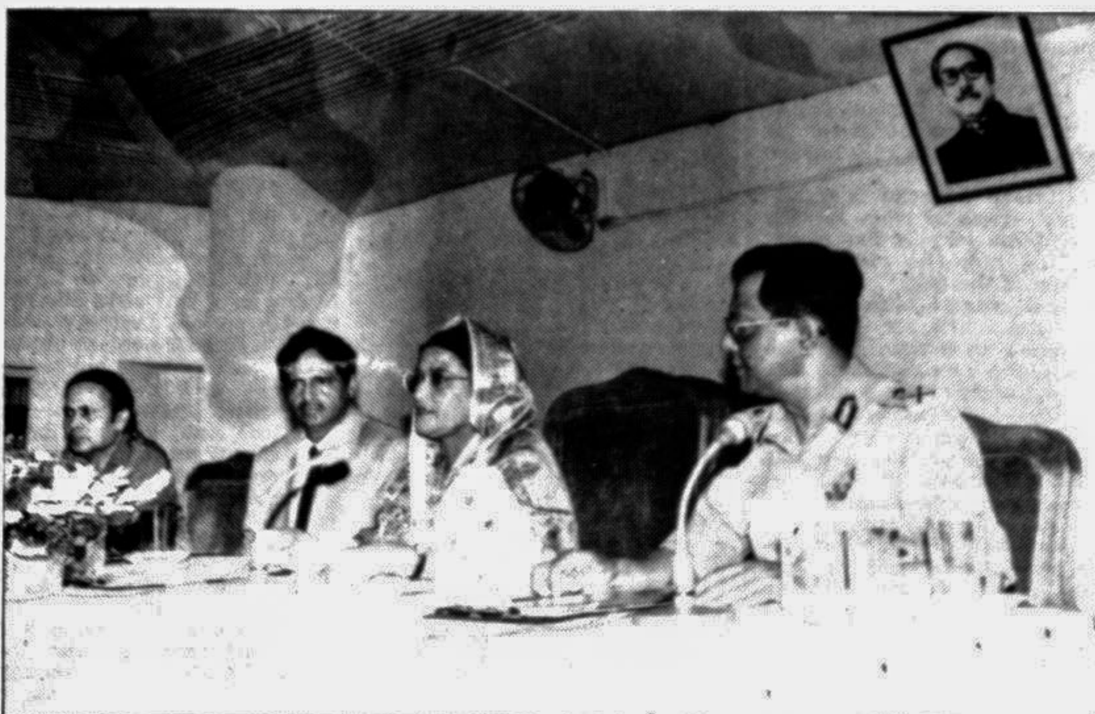
Prime Minister Sheikh Hasina addressing police officers at the Razarbagh Police auditorium in the city yesterday.

BANGLADESH AIR EXPRESS INT'L 9565114-7, 887771, (031) 712127 CGP (041) 25008 KLN