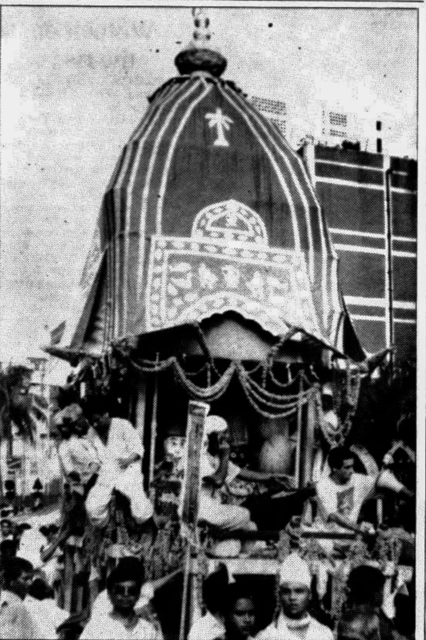
A Rathajatra procession of the Hindu community in the city yesterday.

"A deliberate design is needed to thrust both human resources development and economic growth. The government needs to be determined to achieve such goals," Watanabe said adding, "equity should be ensured in order to make a growth meaningful."