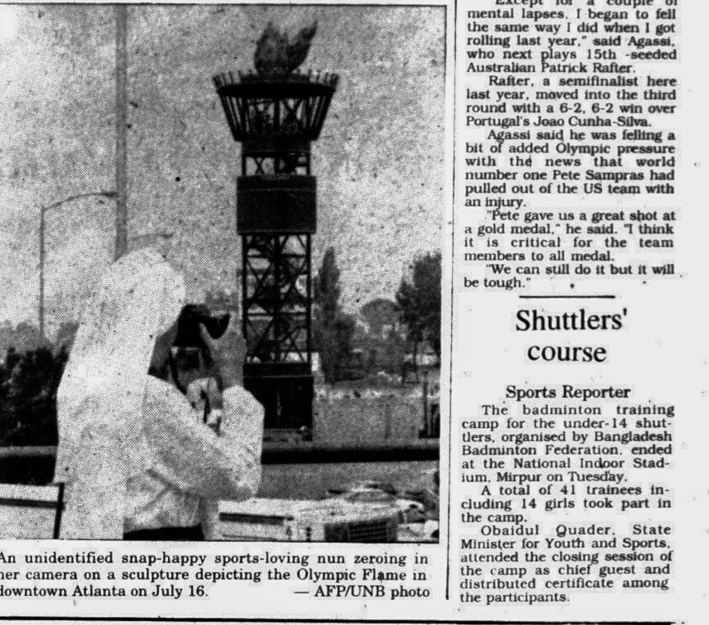
An unidentified snap-happy sports-loving nun zeroing in her camera on a sculpture depicting the Olympic Flame in downtown Atlanta on July 16.

WASHINGTON, July 17: Top seed Andre Agassi, looking to rebound from his disastrous first-round loss at Wimbledon, won his opening match at the Legg Mason Classic tennis tournament in convincing fashion on Tuesday, reports Reuter.