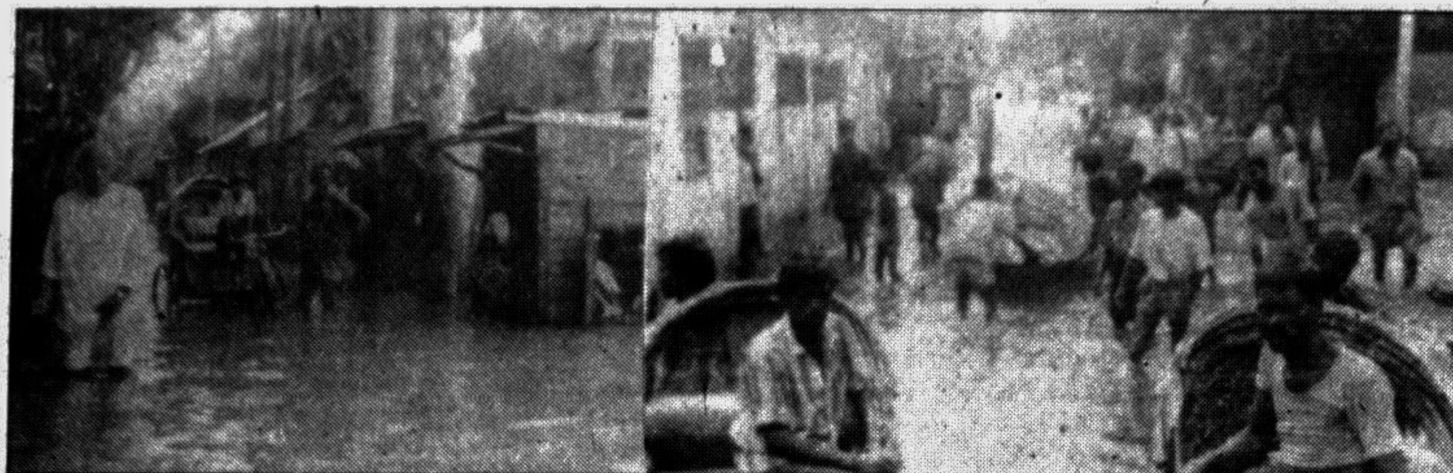
Partial view (L) of the inundated Bridge Road in Gaibandha town. Boat and rickshaws plying together on pavement road in Purbhara.