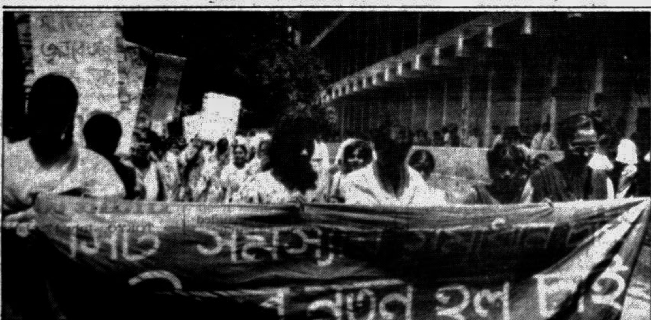
RAJSHAHI UNIVERSITY: Female students brought out a procession demanding new dormitories.

The trust gave 42 thousand taka to 21 brilliant students, 5 lakh 73 thousand taka to various educational, cultural and social welfare institutions and organisations, 12 thousand taka to the proficient people in the fields of sports, culture and education and 1 lakh 60 thousand taka to the Diabetic Association.