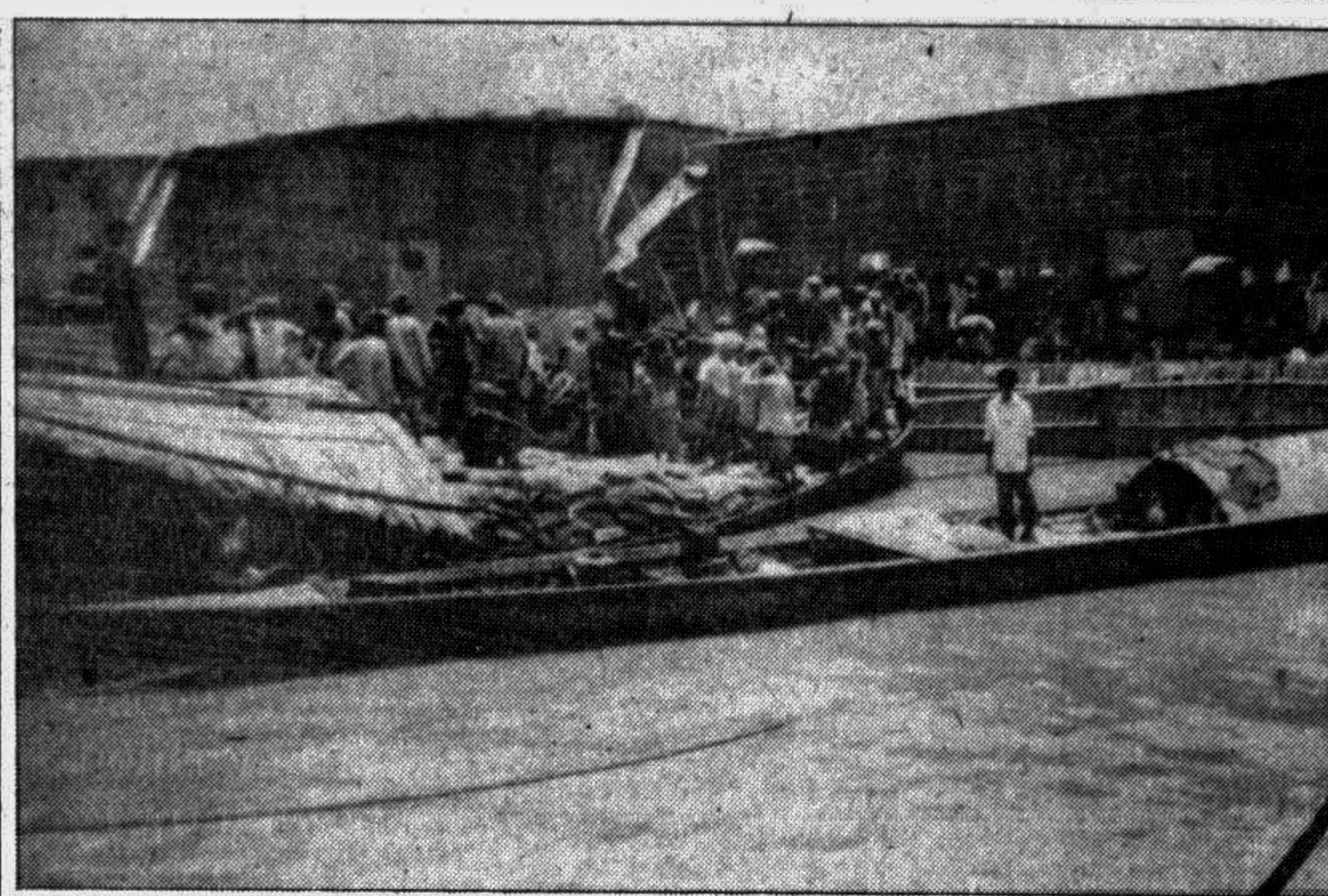
PABNA: Bags containing fertilisers being removed from godowns at Nagorbari ferryghat badly affected by flood and severe erosion.