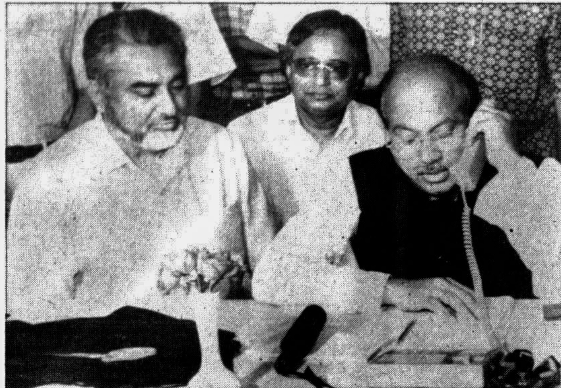
Post and Telecommunication Minister Modammad Nasim (R) inaugurated a new digital telephone exchange in the city yesterday.