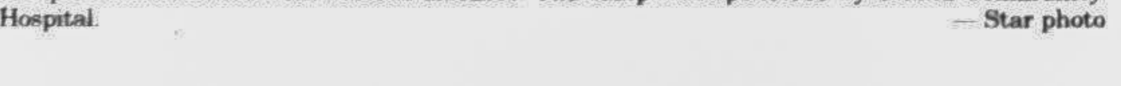
PABNA: A team of doctors conducted a health camp here recently and rendered treatment to 820 patients attacked with various diseases. The camp was sponsored by Dhaka Community Hospital.

The body was sent to the Barisal Sher-e-Bangla Medical College hospital for autopsy.