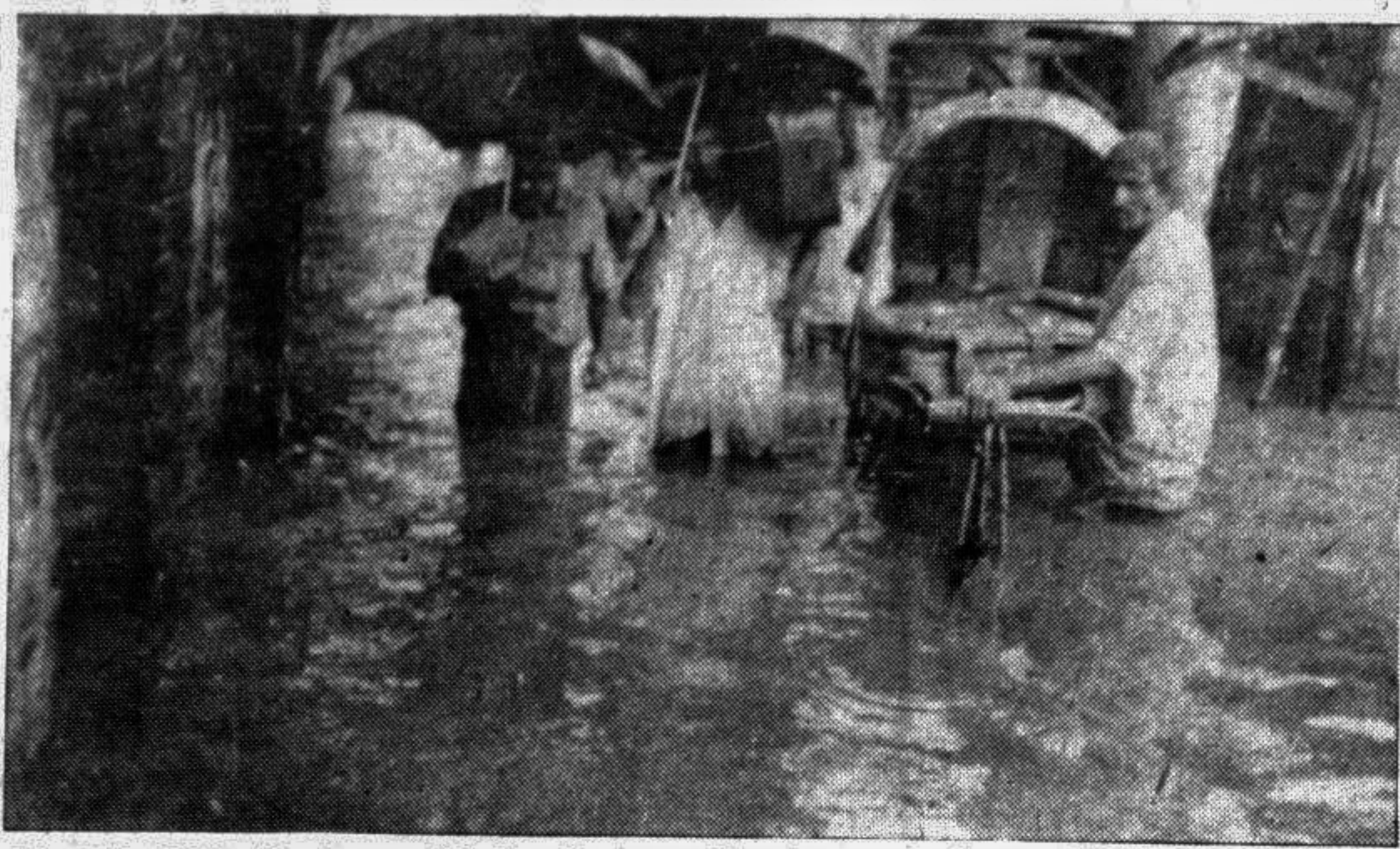
Flood-hit Bridge Road area of Gaibandha town. The photo was taken on Sunday afternoon.