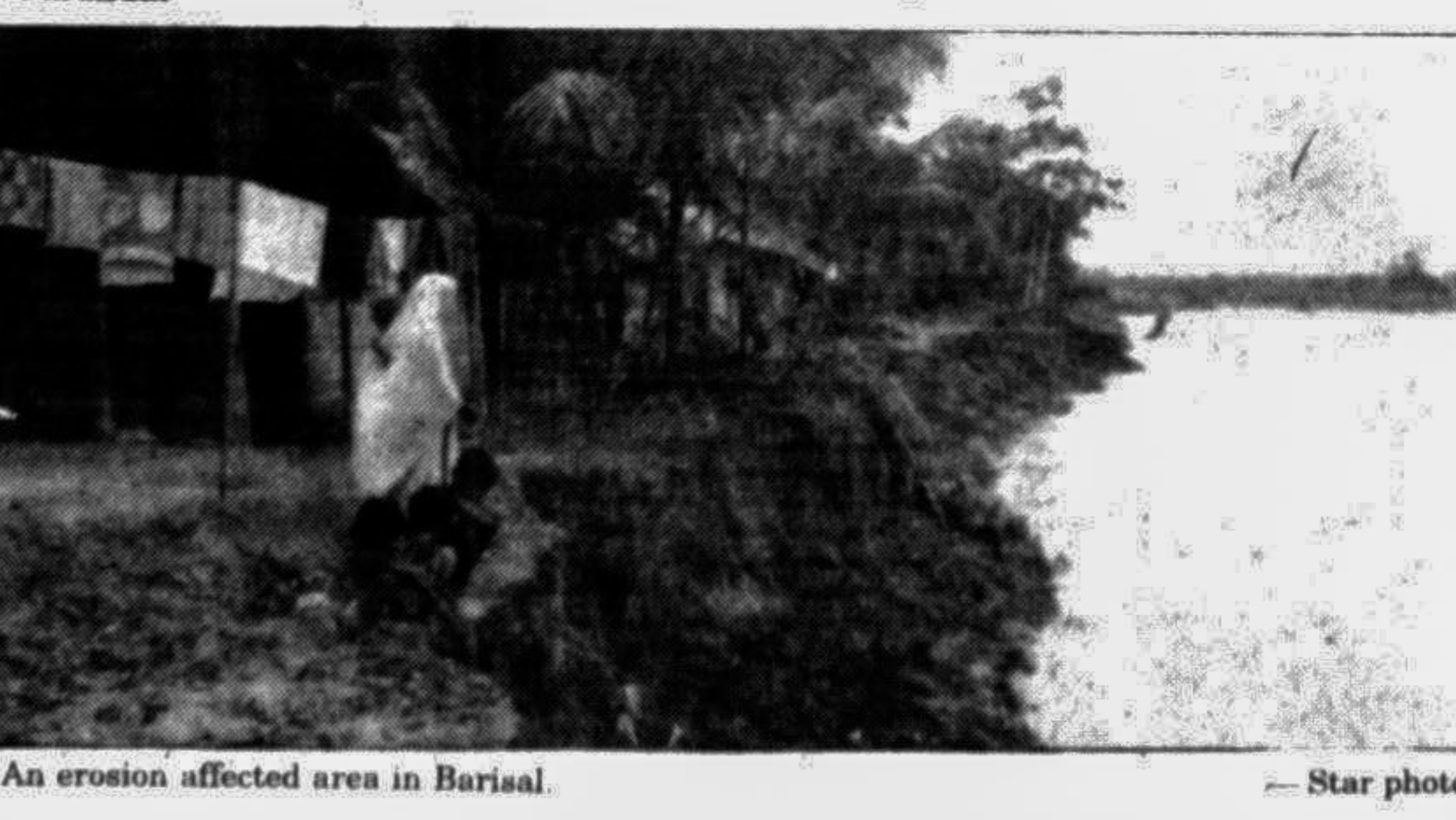
An erosion affected area in Barisal.

Doarika Ferryghat in Barisal is also threatened by erosion of Sandhya river. Launchghat of Jhalakathi is also threatened by the erosion of that river.