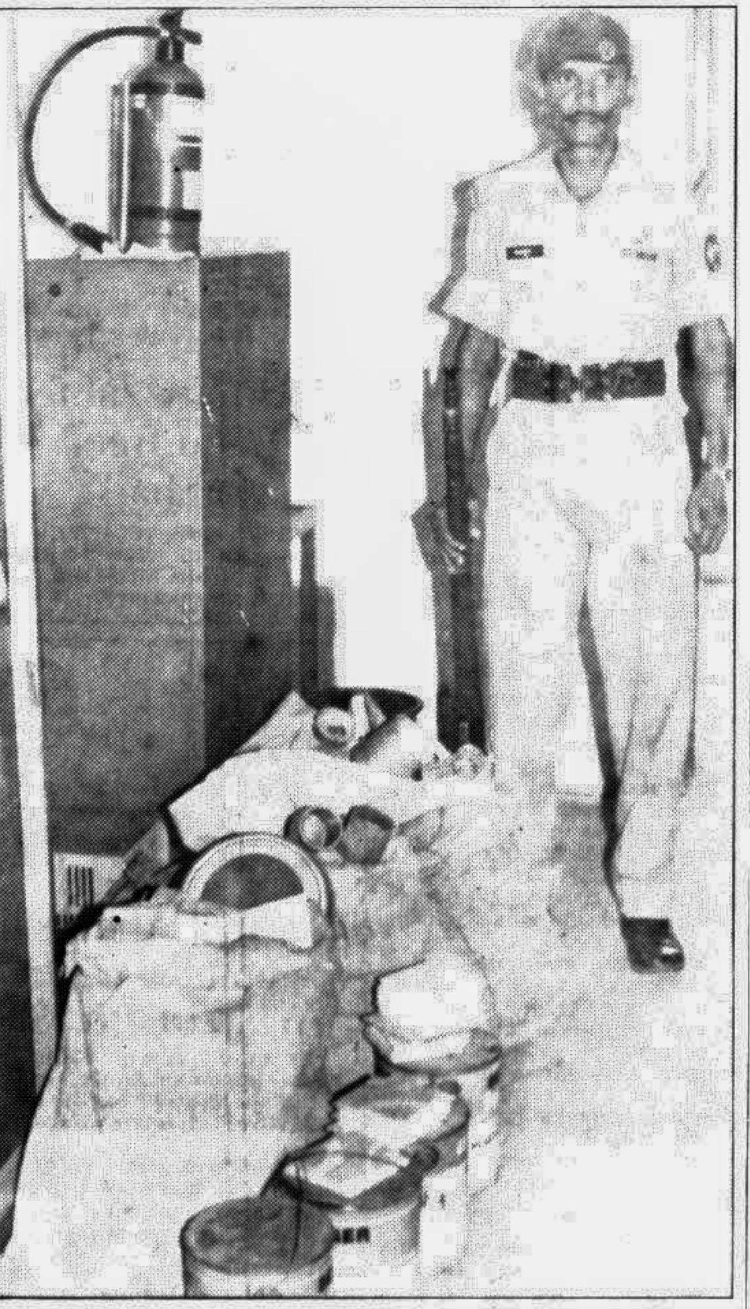
Police failed a bid to steal construction materials from the National Museum in the city yesterday.