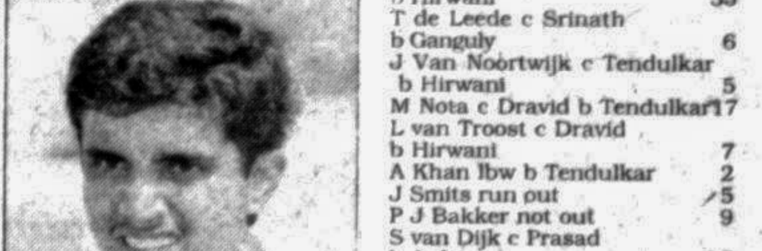
SAURAV GANGULY ... 68