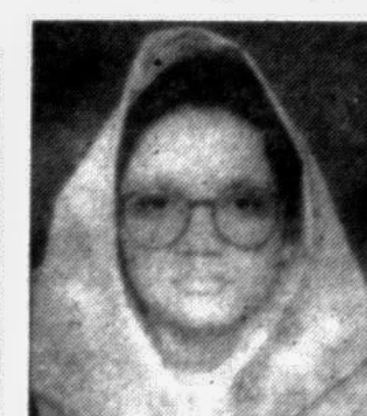
From Our Correspondent