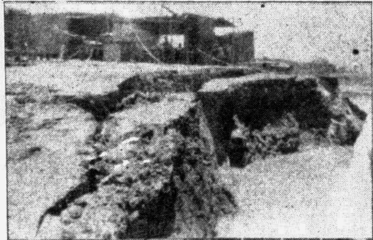
JAMALPUR: Erosion affected Bahadurabad ghat area.

Local people urged the concerned authorities to take immediate steps to check the erosion and send relief materials for the affected people.