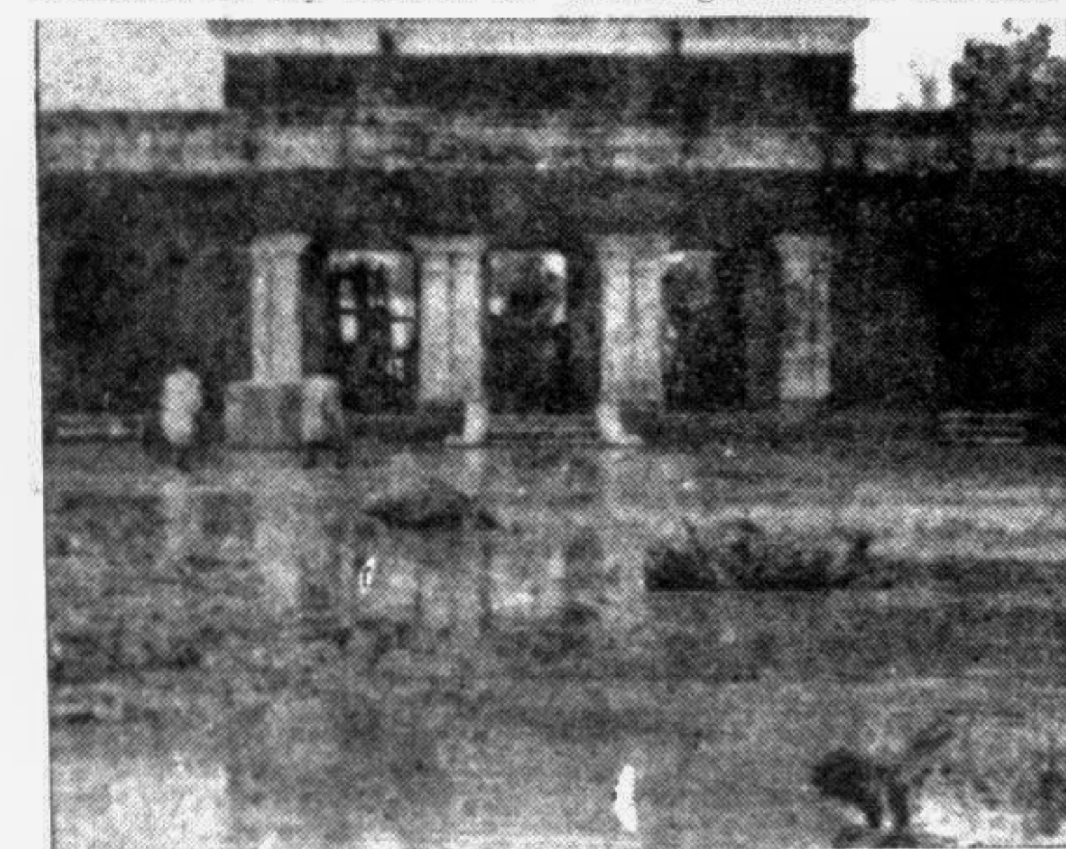
GAIBANDHA: Flood water receding from many areas of the district. The photo, taken on last Thursday, shows Baguria Tahsil office partially submerged by flood water.

primary school and a Tahsil office are badly hit the erosion. Puribogabgachi primary school built four years ago spending Tk 4,20,000 is now on the verge of extinction at any time. Besides, an age-old building constructed during the British regime at Baguria under Gaibandha sadar thana recently used as Tahsil office is facing extinction at any moment as