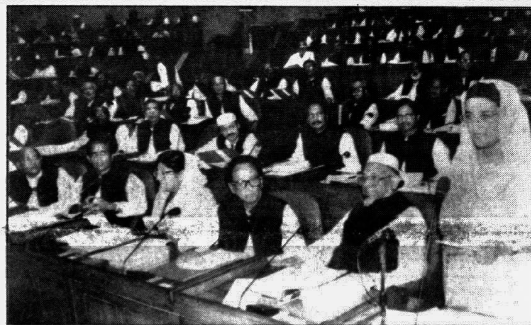
Prime Minister and Leader of the House Sheikh Hasina addressing the Jatiya Sangsad yesterday.

Chowdhury and advocate Hamid were elected by voice votes. There was no candidate from the Opposition for either of the offices. See Page 12 col 8