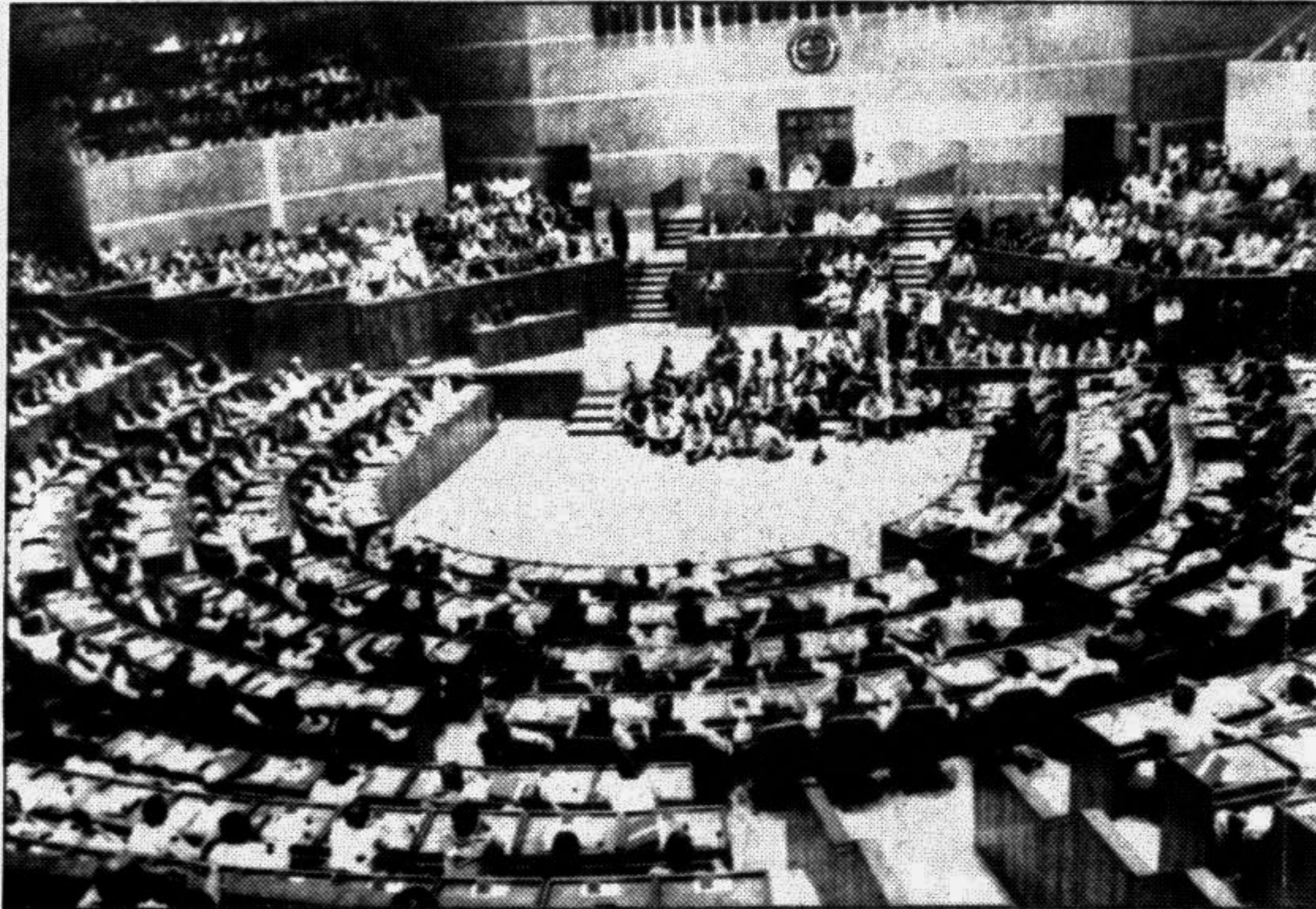
The seventh parliament in its first session yesterday.