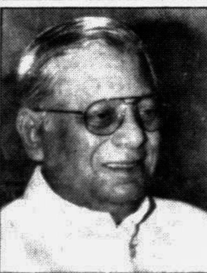
The new Speaker Humayun Rashid Chowdhury, Deputy Speaker, Abdul Hamid Dy Speaker

She also paid rich tributes to Father of the Nation Bangabandhu Sheikh Mujibur Rahman, national leaders, martyrs of the Language See Page 12 Col 4