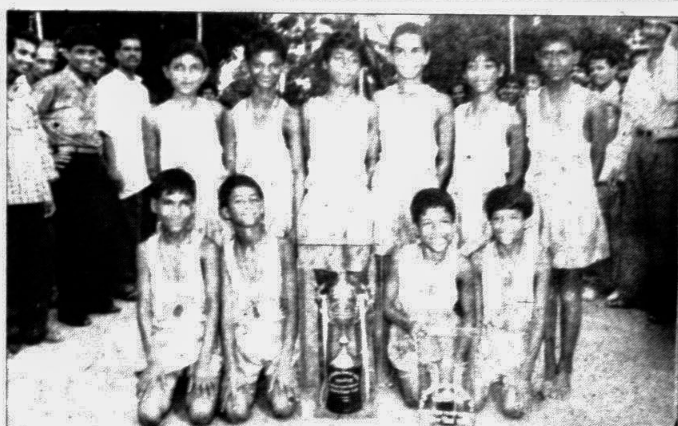
The jubilant Dolairpar High School team, which won the sixth schools kabaddi title.

LONDON, July 12: South African President Nelson Mandela and British Prime Minister John Major announced plans to boost the sports development initiative between the two countries on Thursday, reports Reuters. Speaking at a function in London attended by some of the countries' major sports figures, Mandela said he was delighted with the launch of phase two of the initiative. It will see the British government invest a further 200,000 pounds sterling (310,800 dollars) in the project.