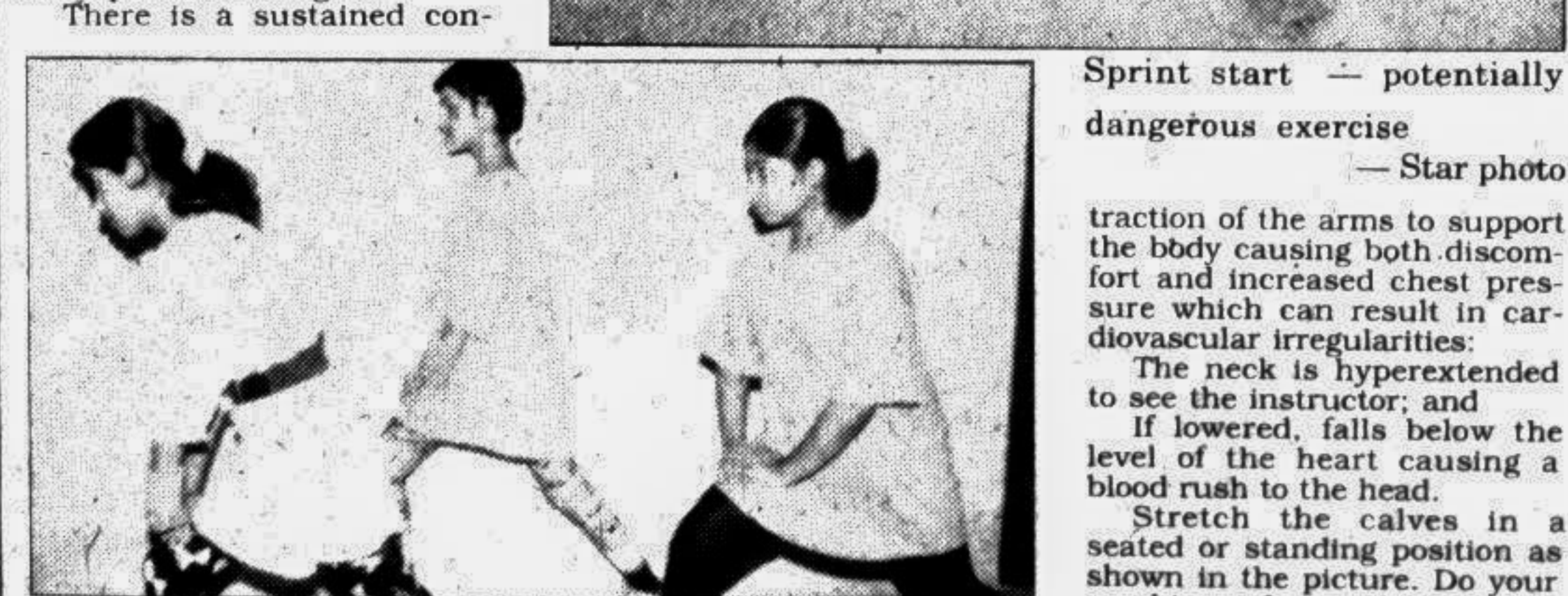
Models stretching the calves muscles.

These exercise are effective, but the risk associated with them makes them potentially dangerous. An example is the sprint start position (as shown in the picture) when used for cardiovascular conditioning. Heart rate can definitely reach a training zone, but there are several risks associated with this position. Regardless of the fitness level of your participants, modify or remove these exercise from the program. Commonly used to stretch the calves and for aerobic work, this position has at least three potential dangers. There is a sustained con-