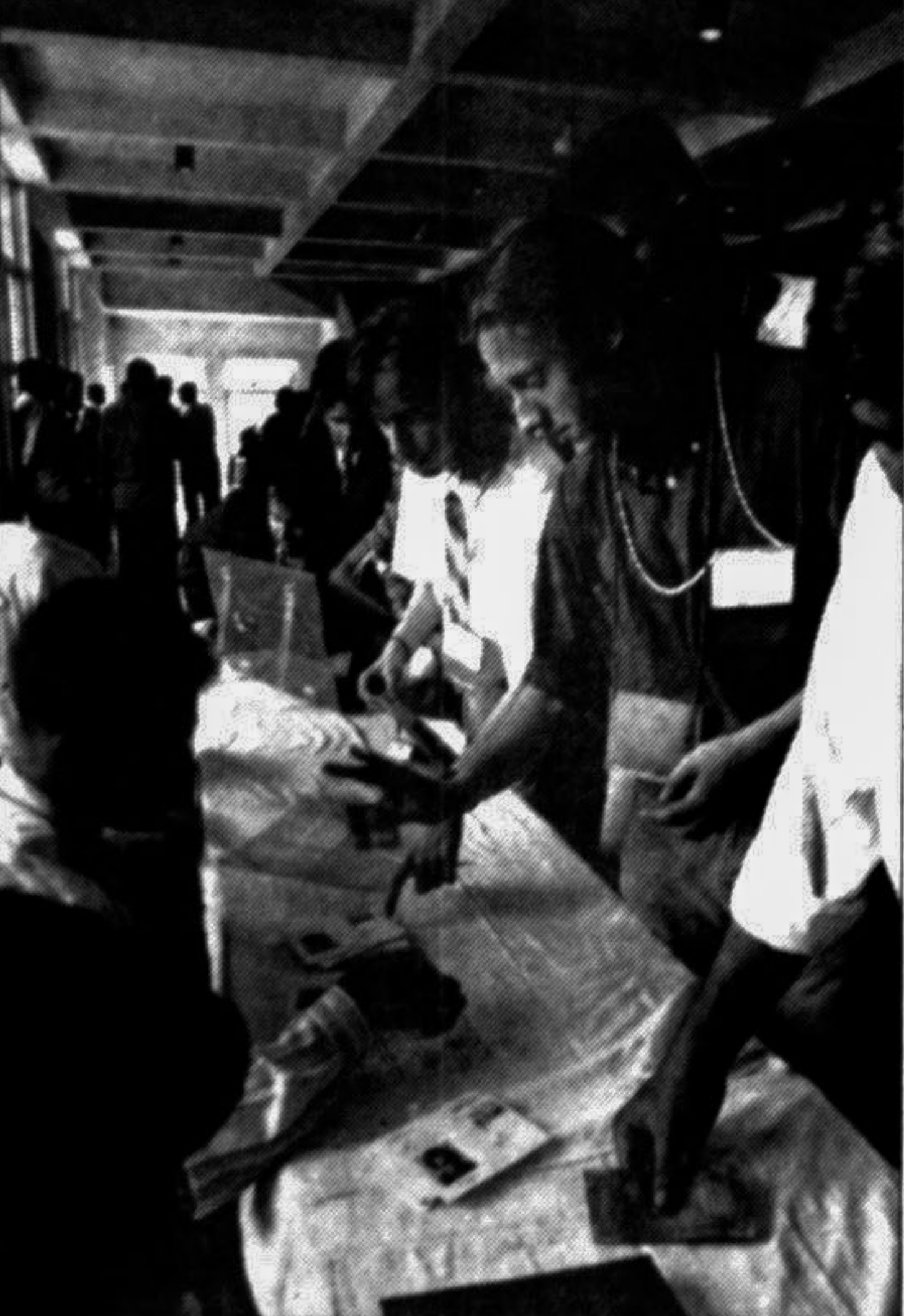
Participants of 37th International Mathematical Olympiad buy the inaugural stamp in Bombay on July 9. Four hundred and twenty students from 75 countries will attempt to solve three mathematical problems in two days of competition: 35 gold, 70 silver and 110 bronze medals are up for grabs.