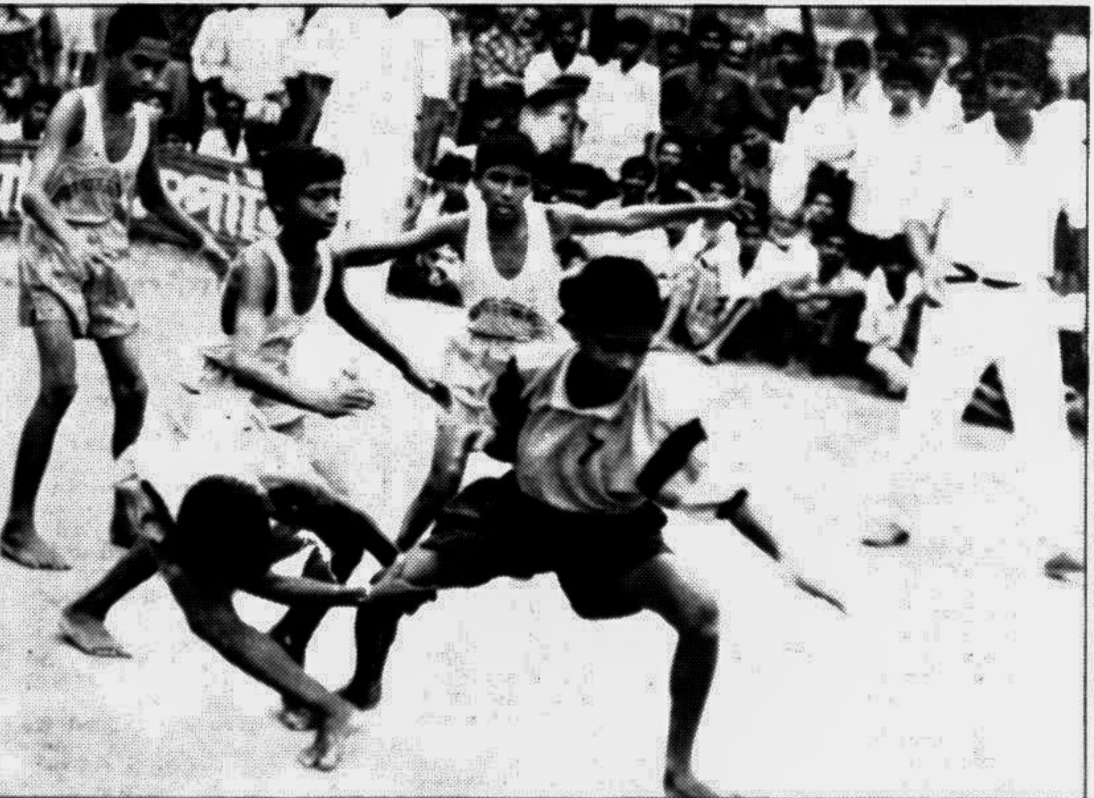
Action from yesterday's sixth schools kabaddi tournament encounter between Shaheed Nabi School and Dolaipear High School at the court adjacent to Dhaka Stadium.