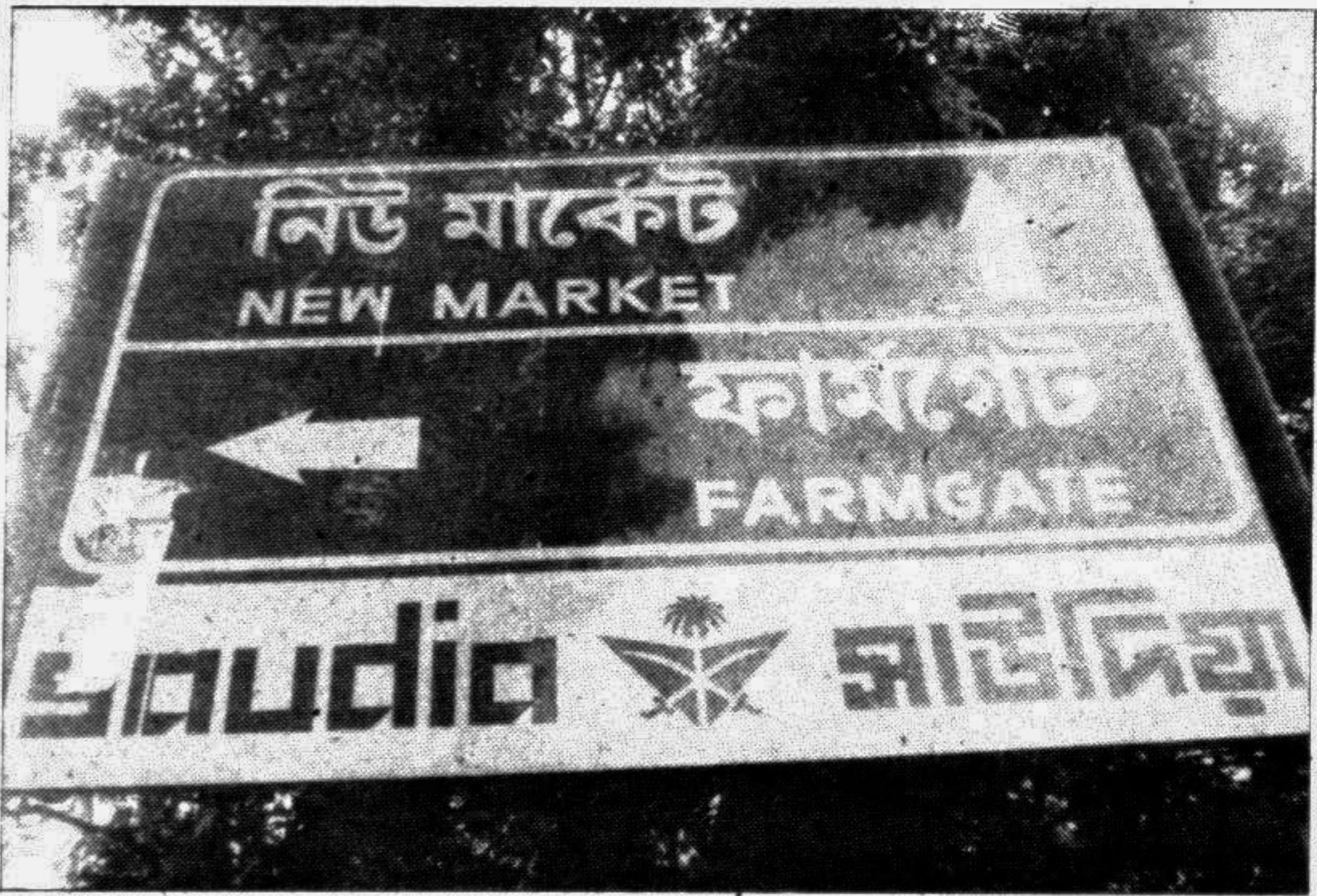
Such road signs are few and far between.

All this hassle, and I am someone who actually lived in Dhaka all her life. I can just imagine what a trial it is for someone who has just moved here—Bangalee or a foreigner. There are many new areas now, and that means new roads. As the population increases and Dhaka becomes more crowded, it will become more and more frustrating to go from one place to another without a clue to where exactly we are headed.