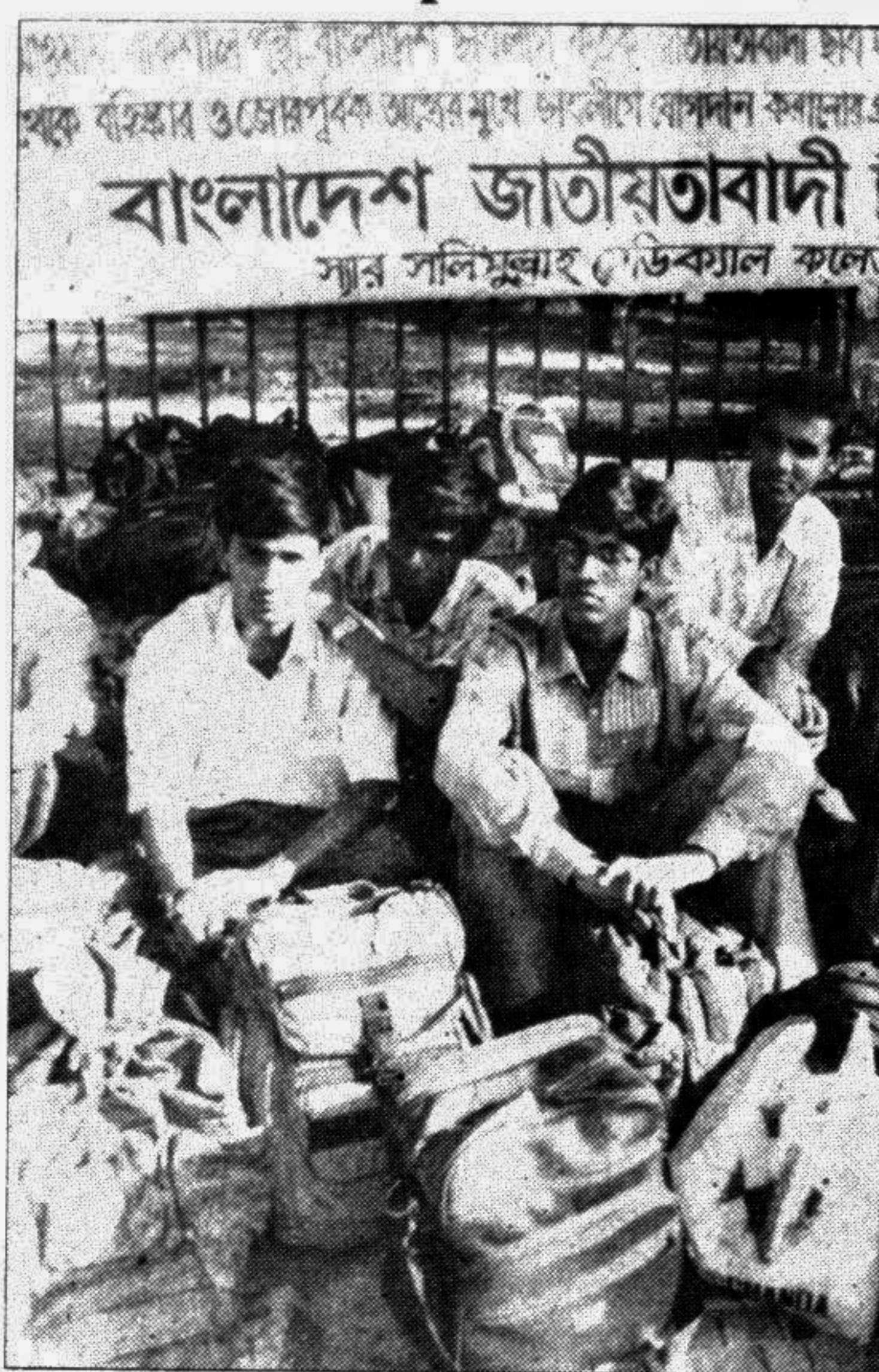
Students ousted from their dormitory rooms reportedly by rivals at the Sir Salimullah Medical College staged a sit-in in front of the Jatiya Press Club in the city yesterday.

They discussed matters relating to mutual interest and exchanged views on the water, resources and flood management of Bangladesh during the meeting.