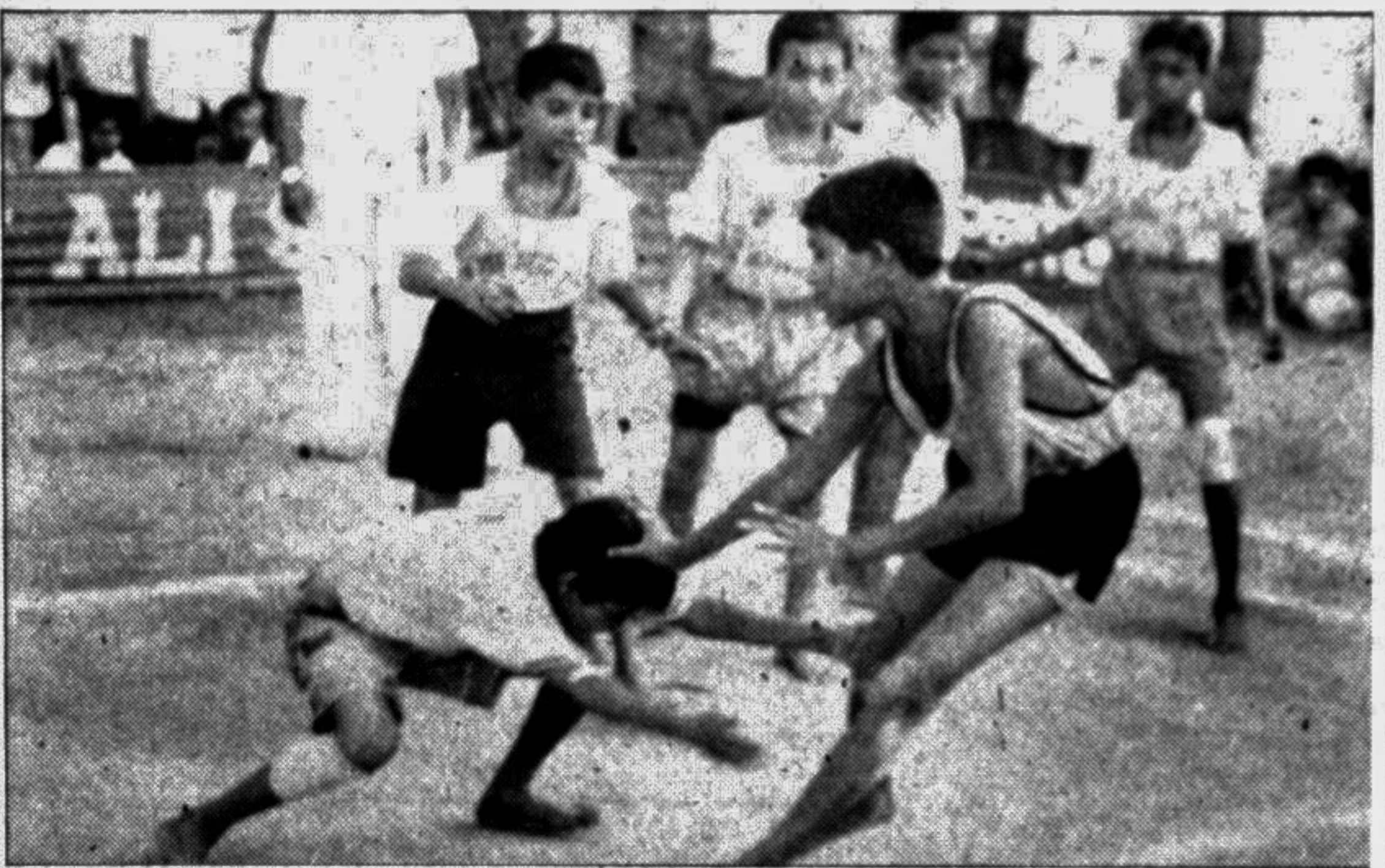
Action from yesterday's sixth schools kabaddi tournament match between Rifles Public School and Maniknagar Model High School at the court adjacent to the Dhaka Stadium.