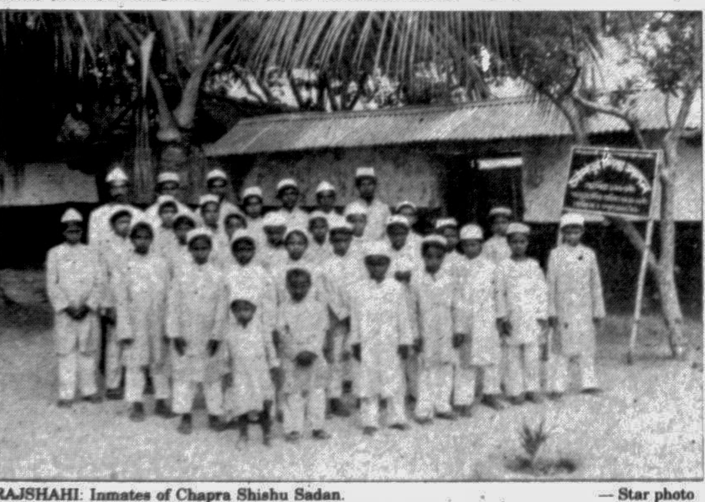
RAJSHAHI: Inmates of Chapra Shishu Sadan.

Tk 25 for education and Tk 40 for clothings. The money is not at all sufficient to meet the demands of the orphans. The shishu sadan authorities, however, try hard to collect donations. Zakats and fitras from the local people often bring smiles in the sales of the orphans. The children are to pass days sometimes without food, it is learnt.