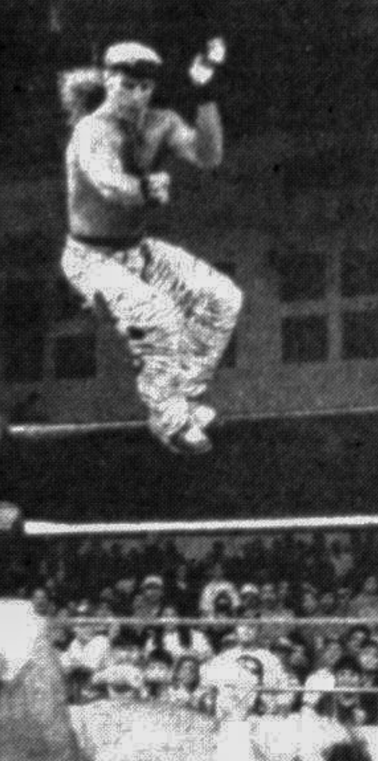
WWF King of the Ring on Star Sports, Tonight at 11:30