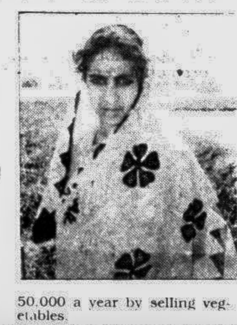
50 000 a year by selling vegetables.