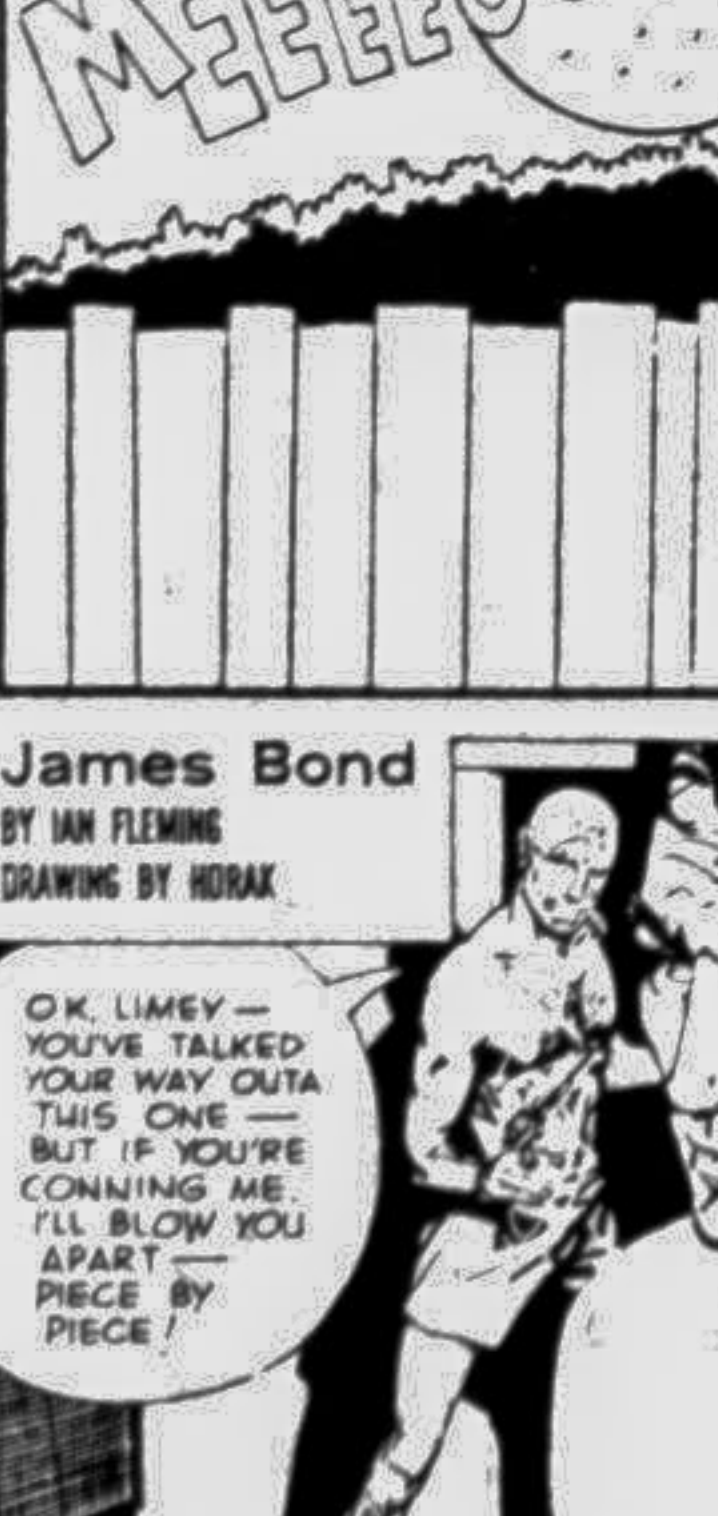
James Bond by Ian Fleming