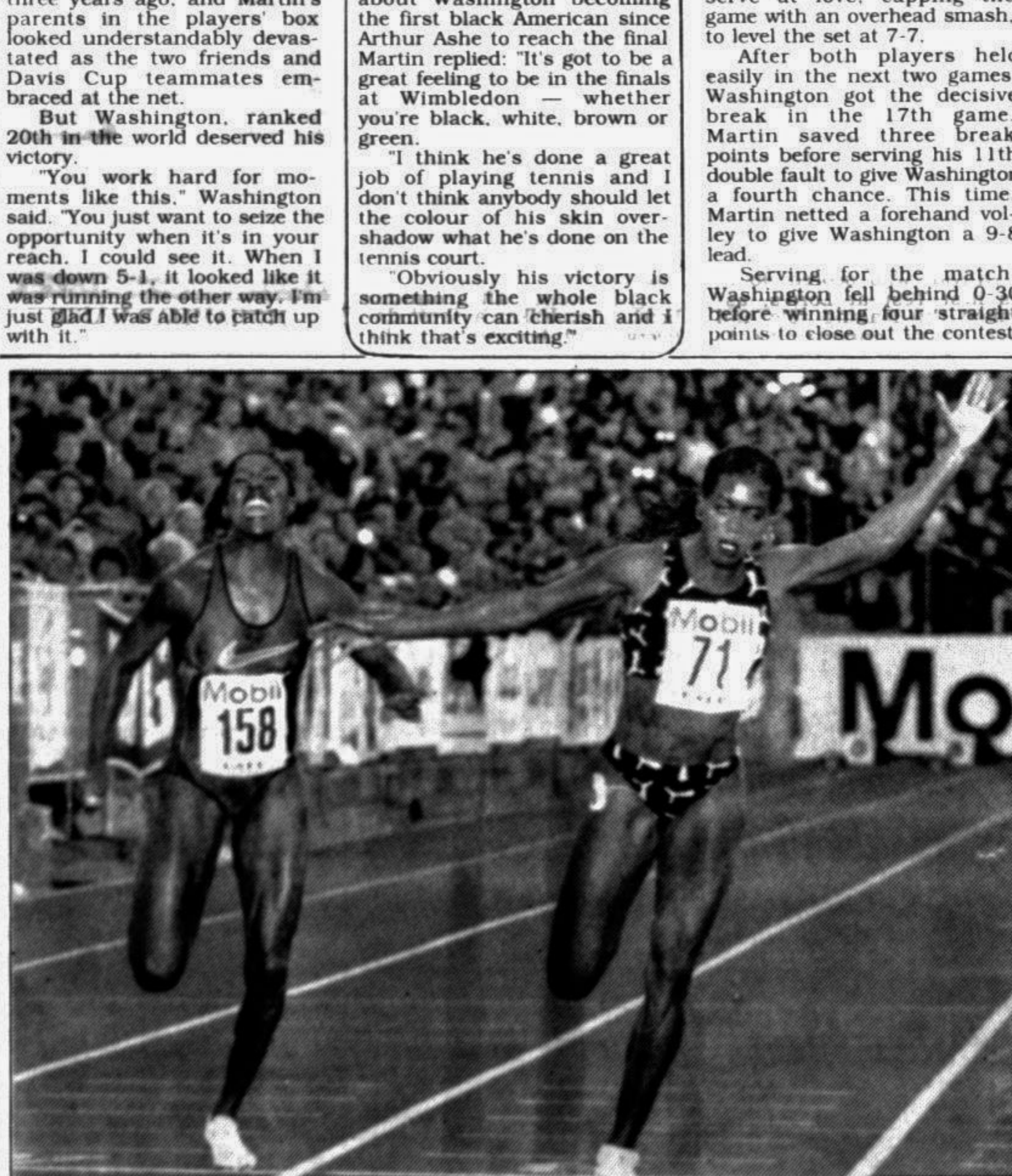
Jamaica's Merlene Ottey (R) crosses the finish line in the women's 100 metres dash at the Bislett athletics meet in Norway on July 5. Ottey won with 10.95 seconds ahead of third placed American Gwen Torrence (L).