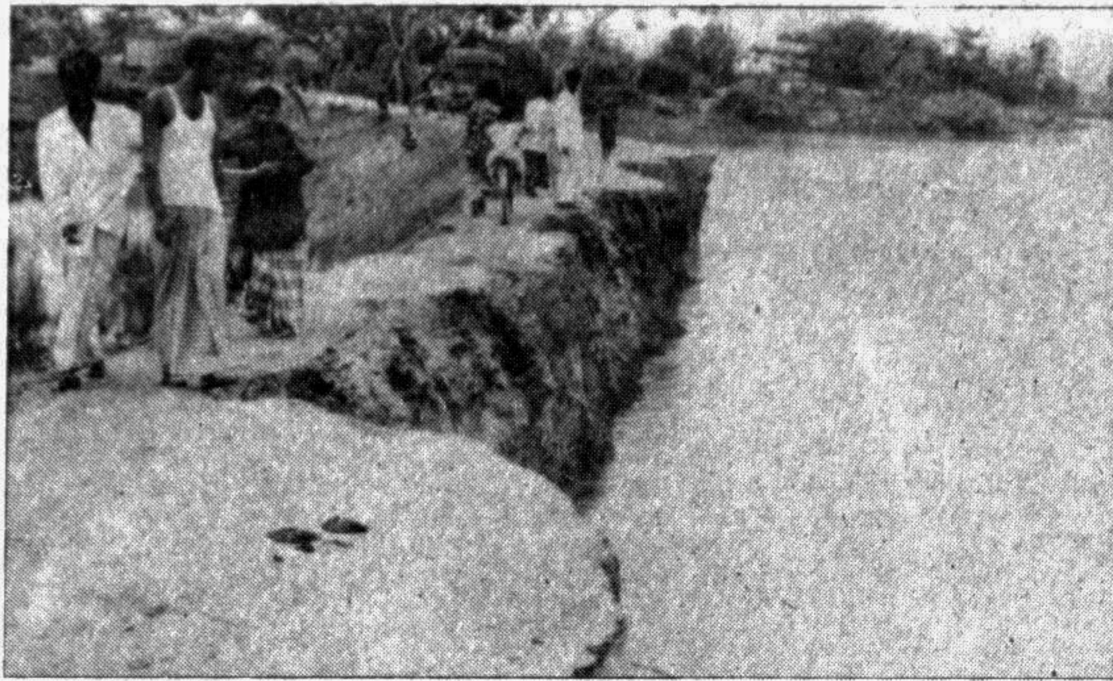
TANGAIL (Bhuyapur): Jamuna river erosion partially engulfed (L) the road-cum-flood control embankment in Gobindadashi village. Breach may occur at anytime that may result in inundation of 20 villages of Bhuyapur Thana. Erosion of the same river at Khandakarpara and Fakirpara point (R) already washed away 40 houses and threaten more areas of the villages. Hundreds of families have already left the adjoining areas fearing fresh attack by the surging river water.

According to proceedings, the accused persons kidnapped and tried to marry Rina Begum at Babuganj on April 24 last year. But on next day, local people caught them and rescued Rina Begum. Later, Rokea Begum mother of Rina lodged a case against five with Babuganj Thana of the district.