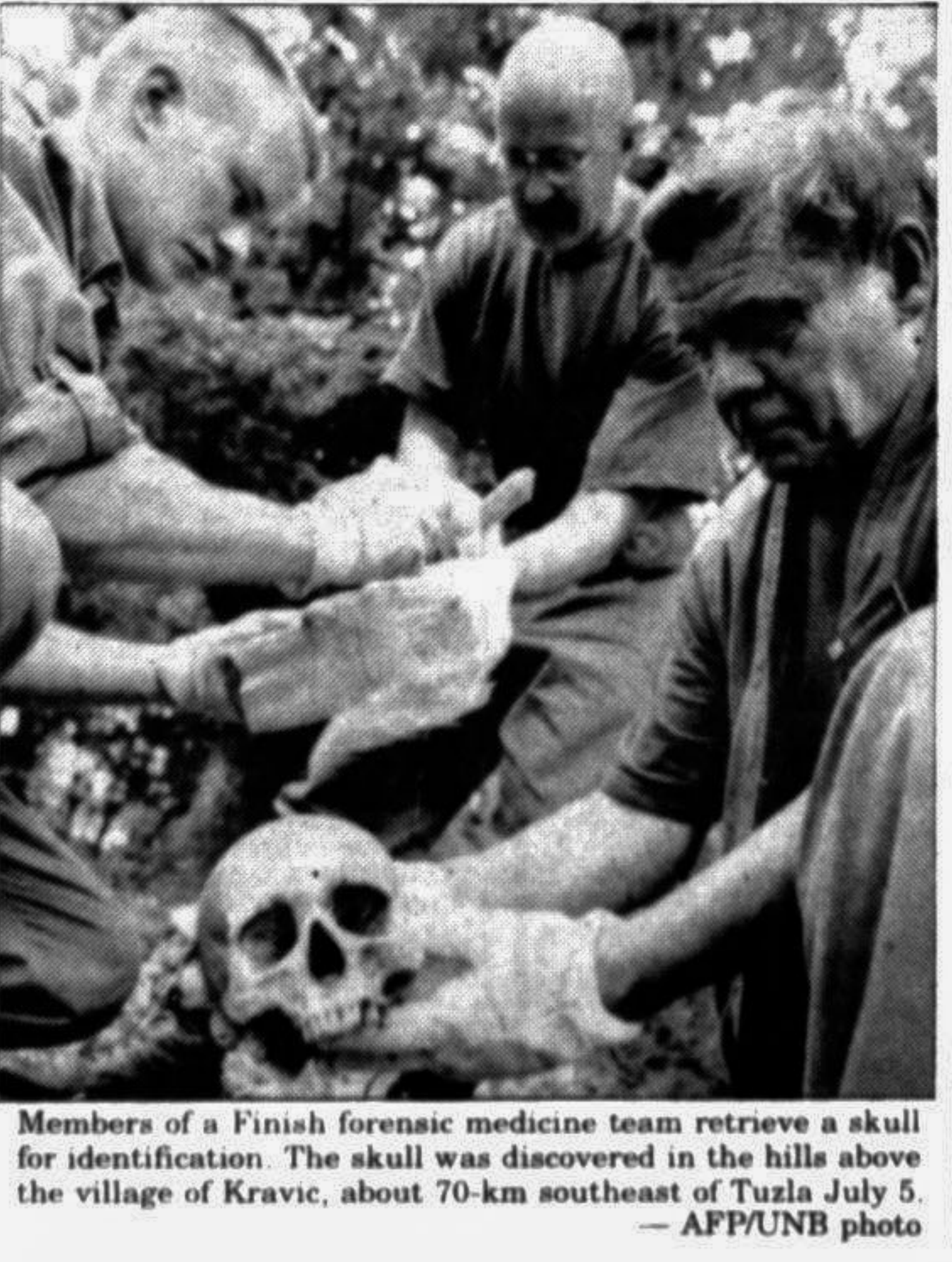
Members of a Finnish forensic medicine team retrieve a skull for identification. The skull was discovered in the hills above the village of Kravic, about 70-km southeast of Tuzla July 5.