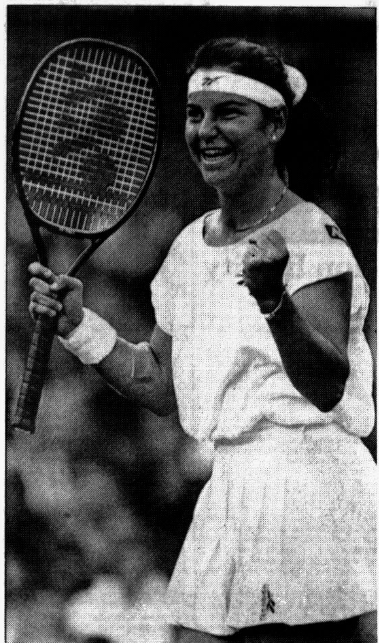
Arantxa Sanchez-Vicario of Spain celebrates her consummate semifinal victory over Meredith McGrath of the United States at Wimbledon on July 4.