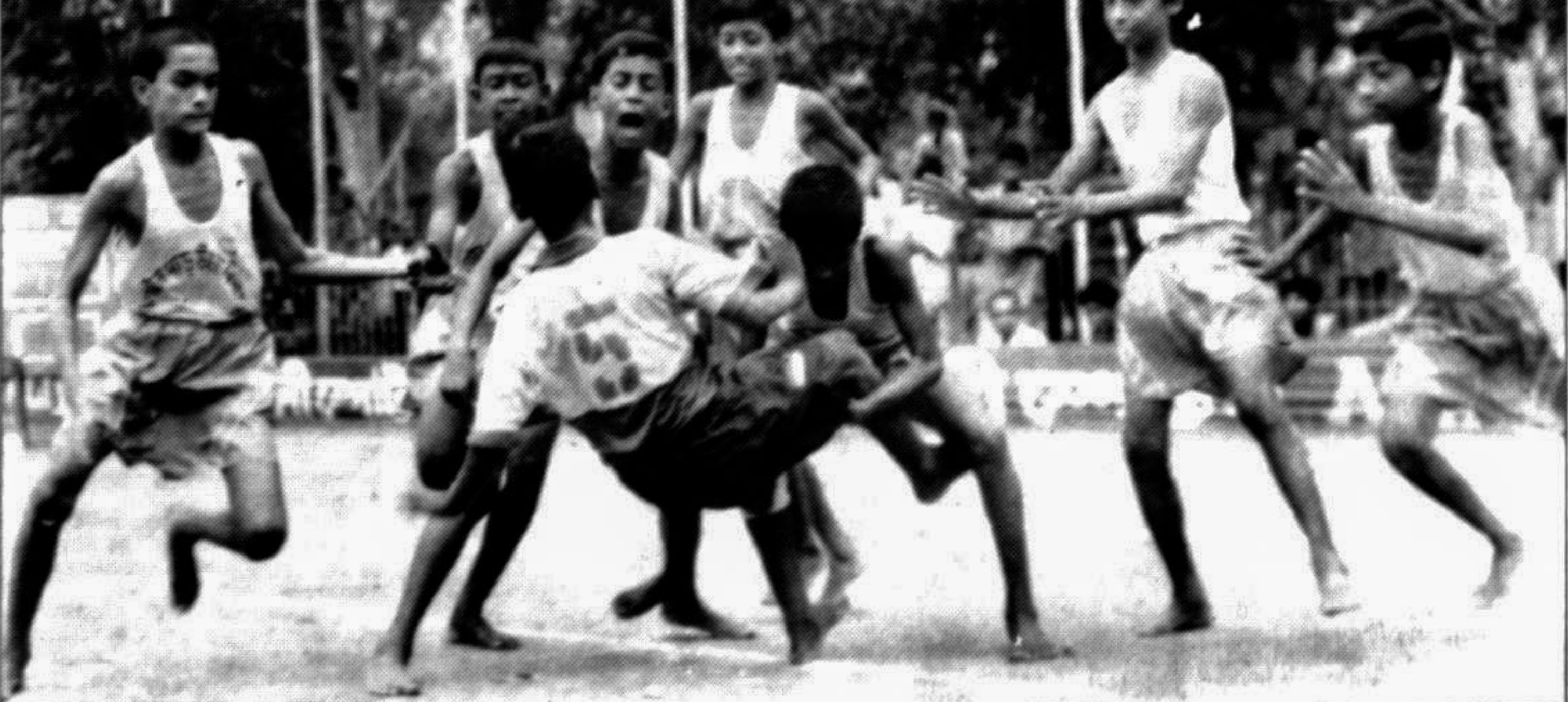
Action from yesterday's schools Kabaddi championship match between Dholaiar High and Ram Krishna Mission High at the Kabaddi court of Dhaka Stadium.