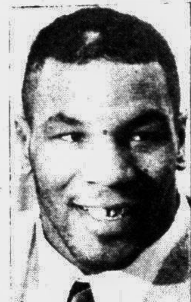
Mike Tyson (American heavyweight boxer) "I hear he's saying everyone is afraid of him. Well, Mike Tyson is not afraid of him. I'm not afraid of anyone. Bring him on." On being asked about his British rival Lennox Lewis.

Name _____ Class _____ School Address _____ Phone: (if any) _____