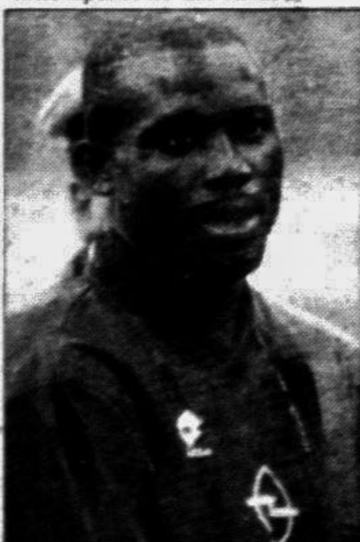
GEORGE WEAH Weah's immediate plans are to fly to Jamaica for an African all-star team match against the Jamaican national team. He will then return to New York to play for the FIFA World All-Stars at Giants Stadium on July 14. Despite troubles at home,