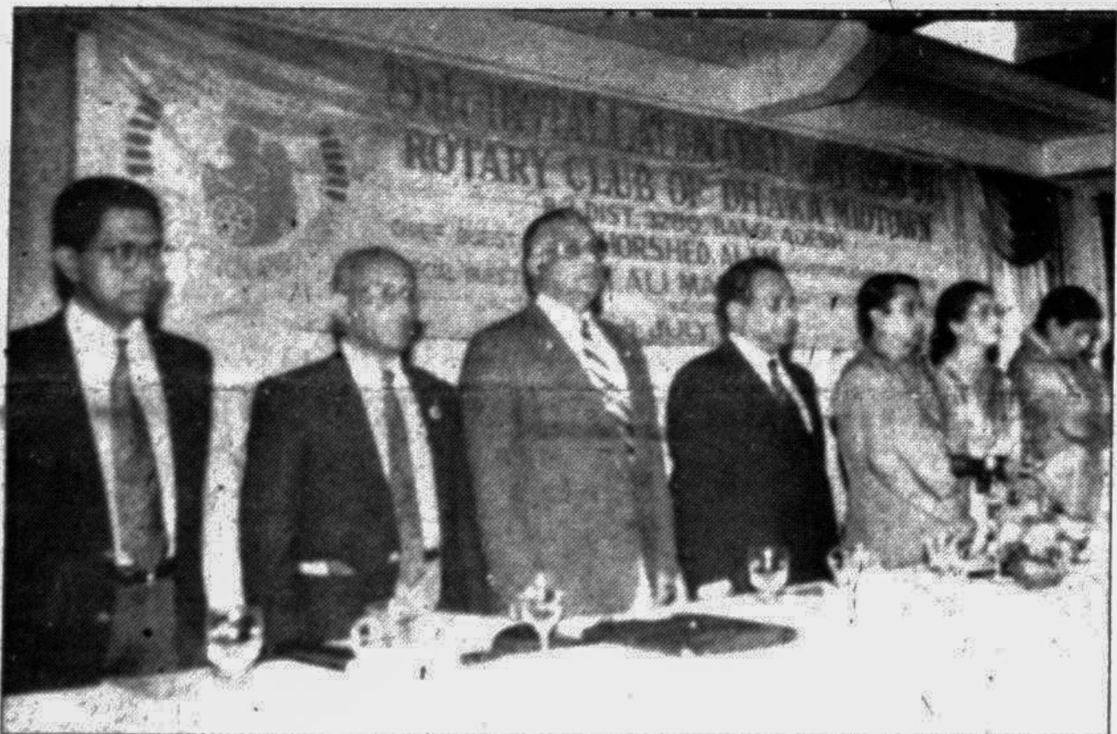
The 19th installation ceremony of Rotary Club of Dhaka Mid-town was held at a local hotel Wednesday.

DOS DATA INPUT-OUTPUT SERVICES LIMITED 14/A Jahanara Garden, Green Road Dhaka 1215, Bangladesh Tel: 315565 Fax: 880-2-813471