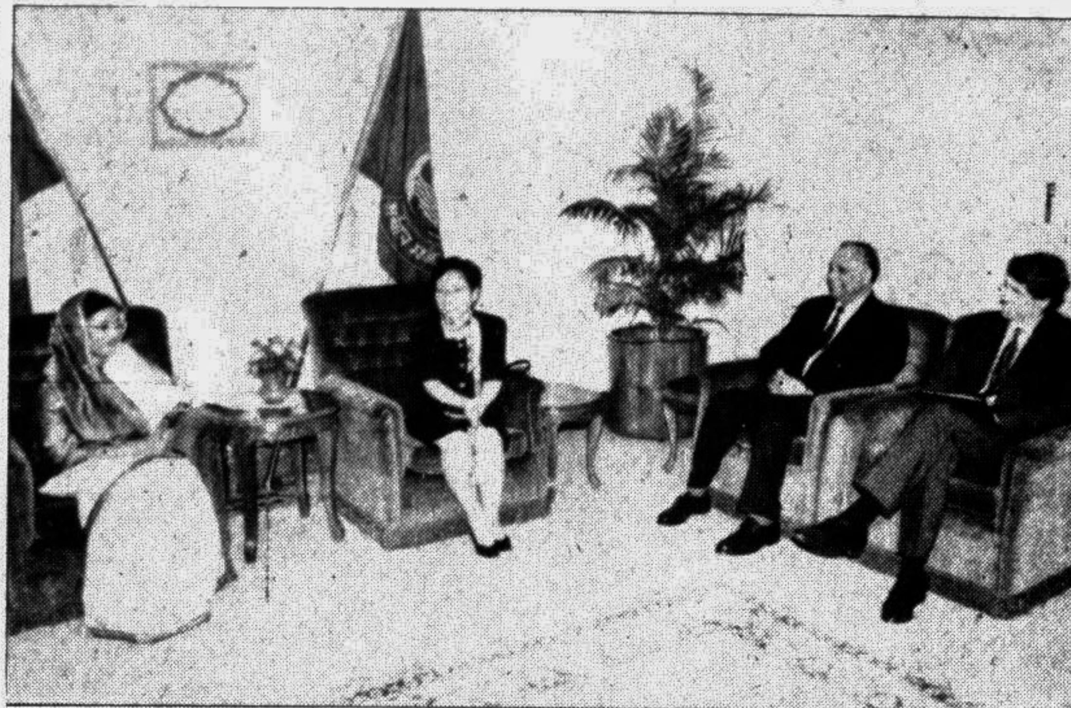
A delegation of UN agencies in Dhaka, led by UNDP resident representative Rimi Watanabe, called on Prime Minister Sheikh Hasina at her office Wednesday.

Human Rights — is as clear as an opinion-button, but makes a much more differentiated claim: it cuts at human rights, but "doesn't cut off the viewer's head."