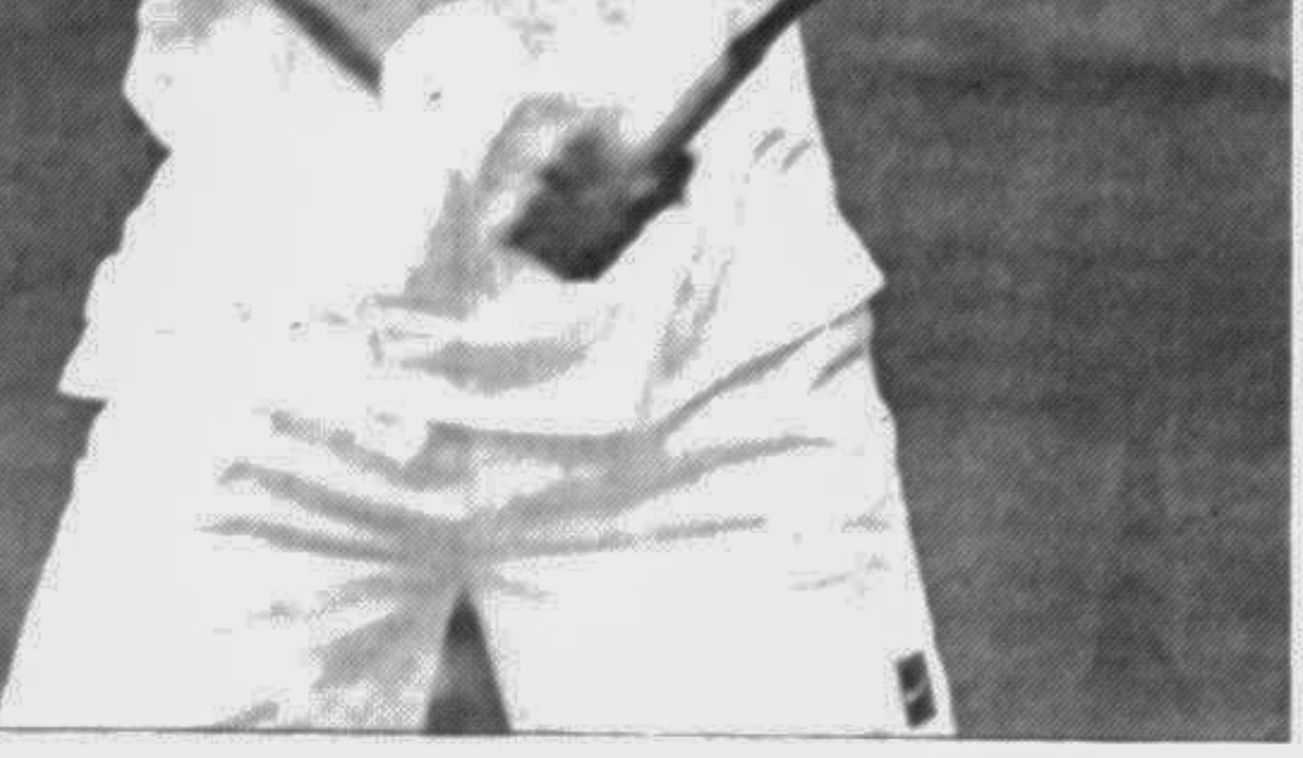
Dutchman Richard Krajicek plays a backhand return against German Michael Stich during their Wimbledon fourth round match on July 2. Krajicek won 6-4, 7-6, 6-4.

Krajicek against Stich was not just a big service battle despite the 13-9 ace count in favour of the Dutchman, who was promoted into Thomas Muster's place in the draw after the Austrian seventh seed withdrew before the tournament through injury.