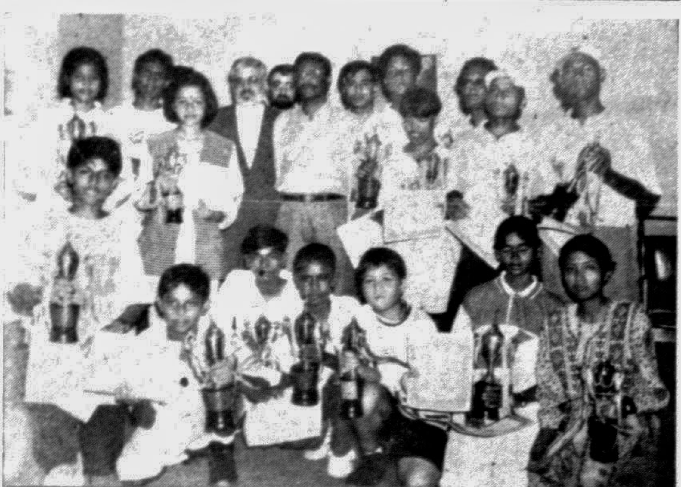
Winners of junior age-group tennis pictured with Obaidul Quader (6th from left, standing), State Minister for Youth, Sports and Culture.

Obaidul Quader, State Minister for Youth, Sports and Cultural Affairs, witnessed the matches and distributed prizes among the winners.