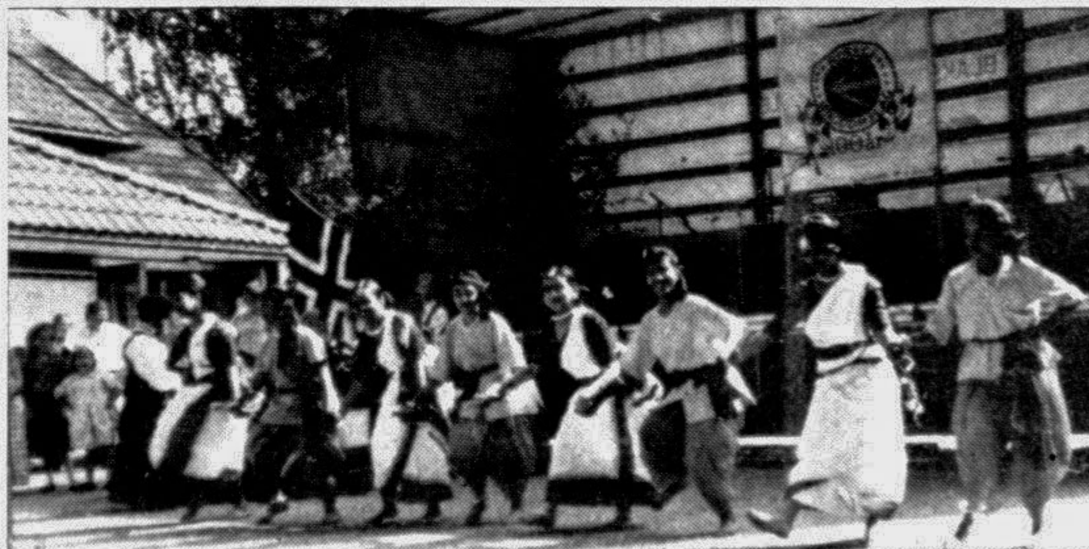
Artists of Kachi Kanchar Mela performing a dance at an open-air stage in Norway recently.

The performers, aged between 10 and 16, performed Santali, Manipuri, Kathak and tea-leaves dances, presented Nazrul and folk songs, and staged a dance-drama. Children of different organisations in Arendal also performed with the Bangladeshi artists.