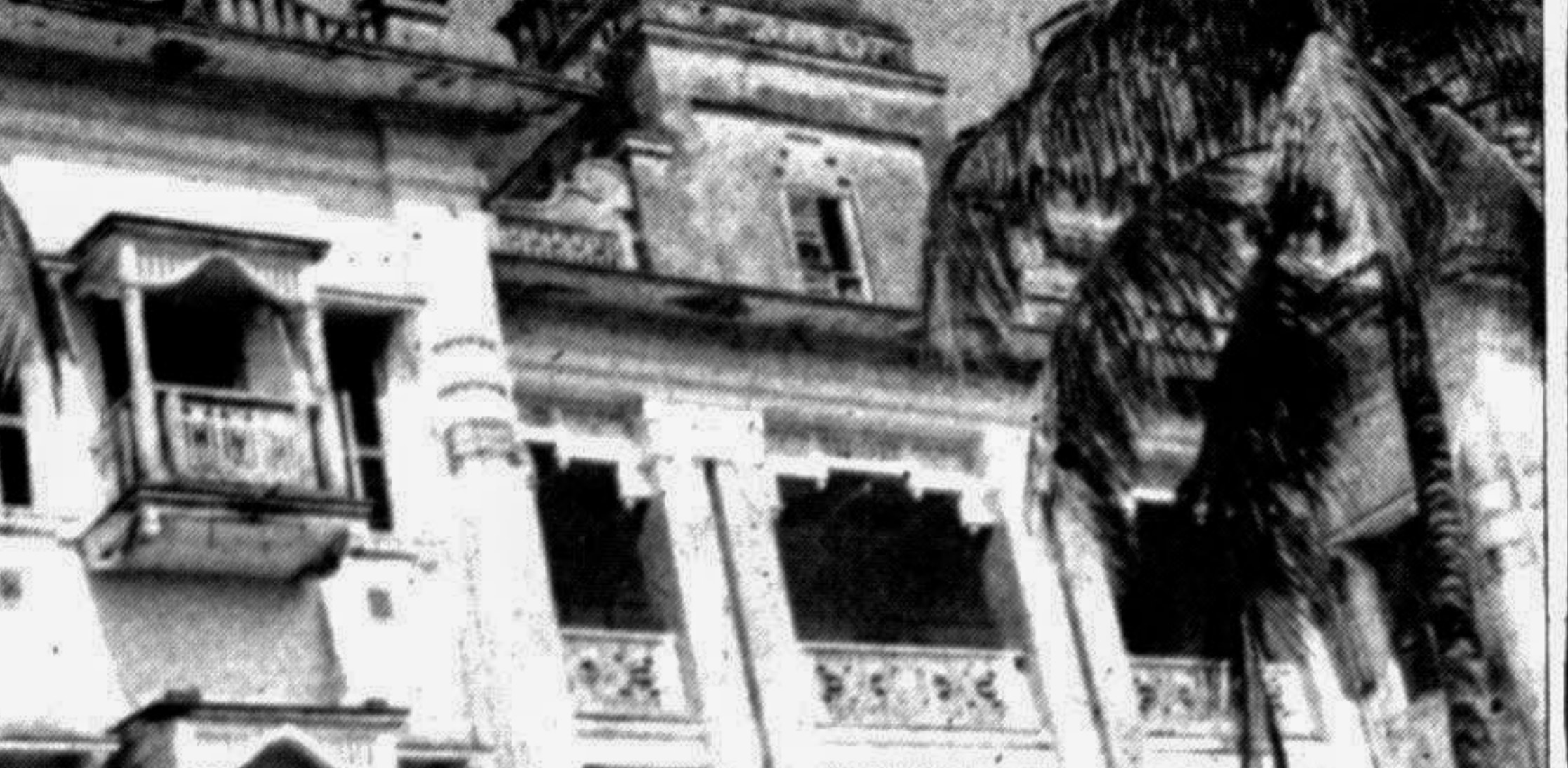
The century old Jamindar Bari at Nagarpur thana of Tangail district.

A large building belonging to M H Joarder