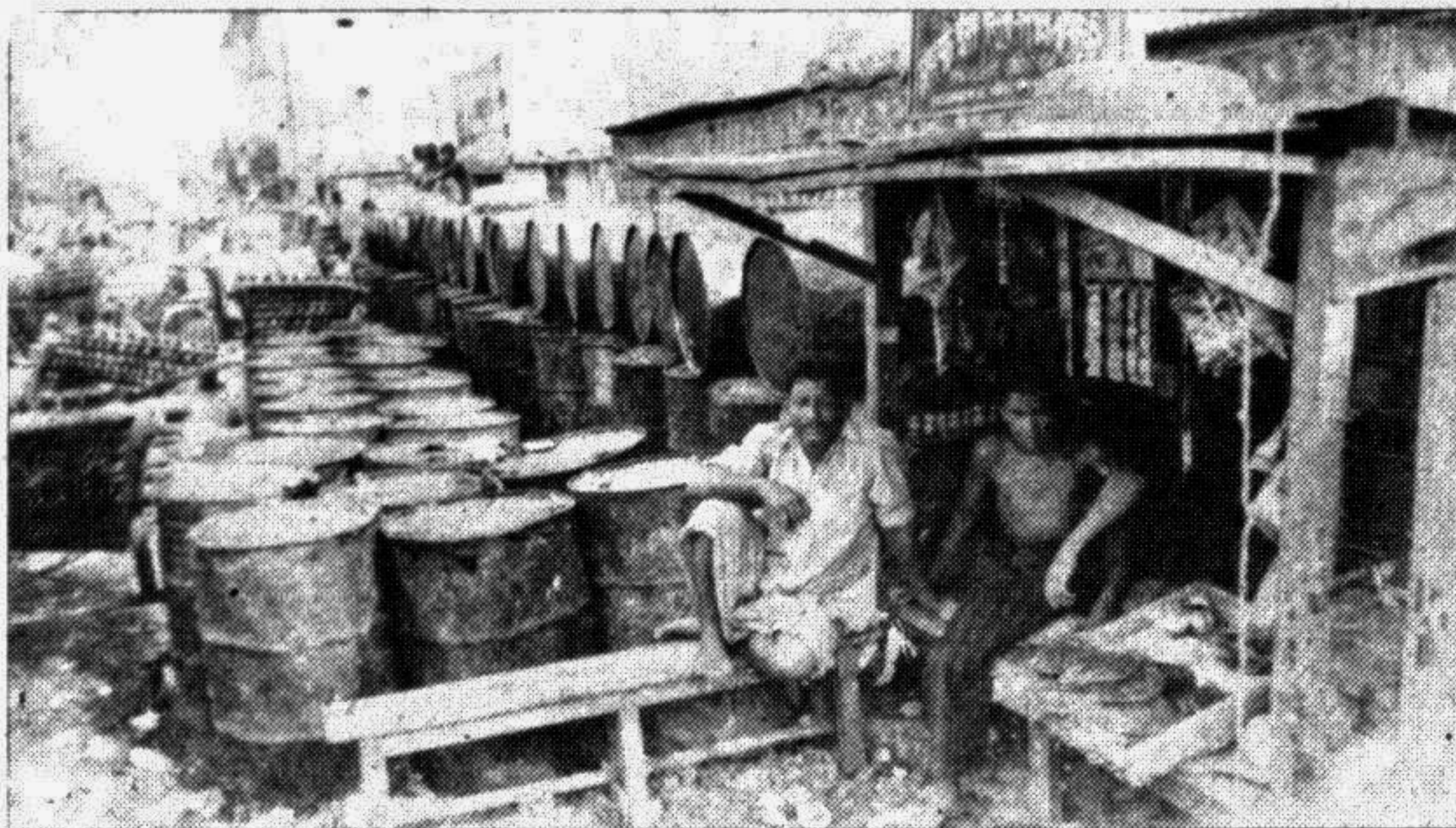
Gasoline sellers occupy footpaths and parts of roads at Waize Ghat, causing obstruction to traffic in this part of the old city.