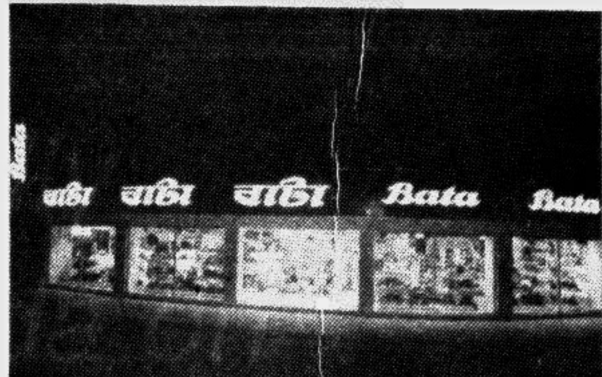
Most Modern Retail Store

The Bata Shoe Organisation is the largest manufacturer and marketeers of footwear in the world. Its worldwide operations span throughout the world, with thousands of people working to meet the demands of millions around the world.