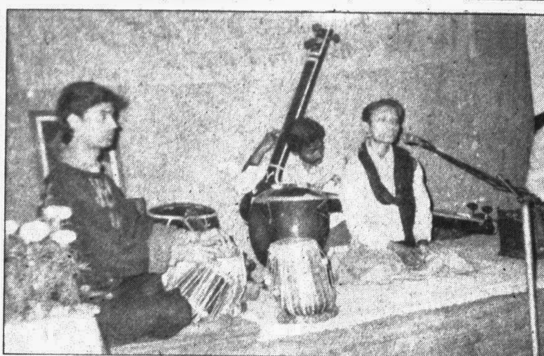
PABNA: An artist's rendering song at the Rabindra-Nazrul Joyanti festival held here recently.