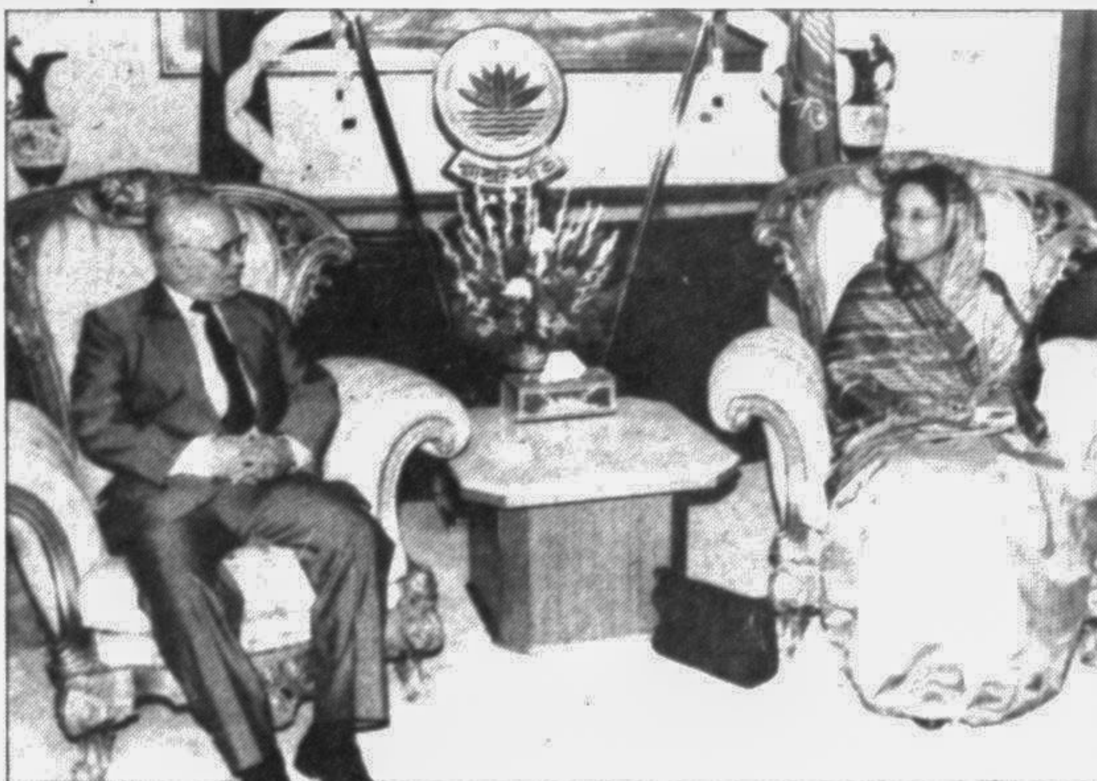
Prime Minister Sheikh Hasina called on President Abdur Rahman Biswas at Bangabhaban yesterday.

The cleansing of the Buriganga river on all counts has, therefore, become an urgent task. The pollution needs to be eradicated by banning industries of all sizes and kinds from emptying any waste without due treatment processes. The Department of Environment has a great responsibility in this respect. In the event of our failure to take remedial measures on a priority basis, we may be living by a stinking cesspool before long.