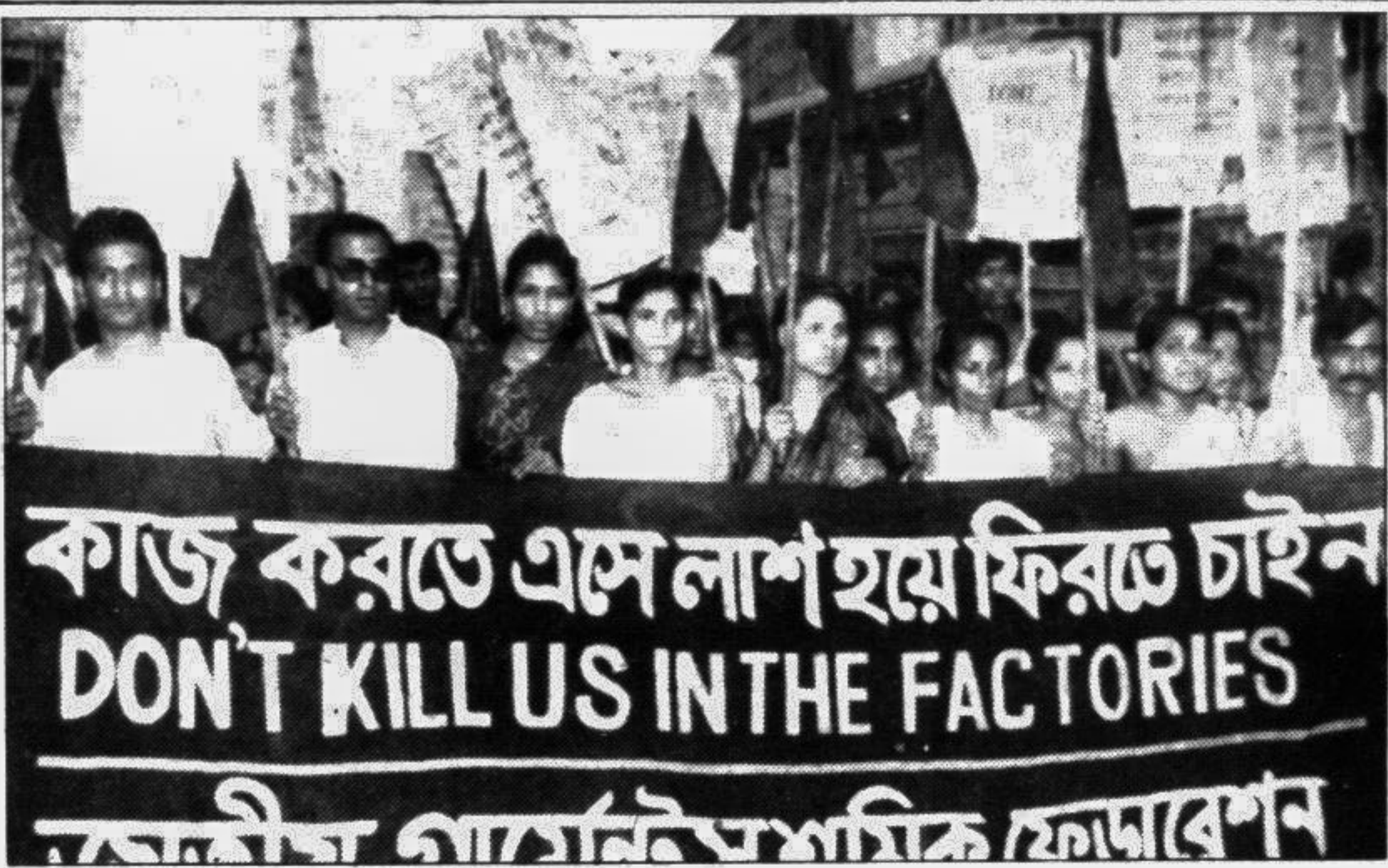
The Bangladesh Garments Sramik Federation brought out a procession in the city yesterday protesting inadequate fire safety measures in garments factories.

Witnesses said three miscreants equipped with sawed-off rifle and pistols swooped on the counter of Sohag Paribahan at Dampara in Doublenooring thana and demanded toll.