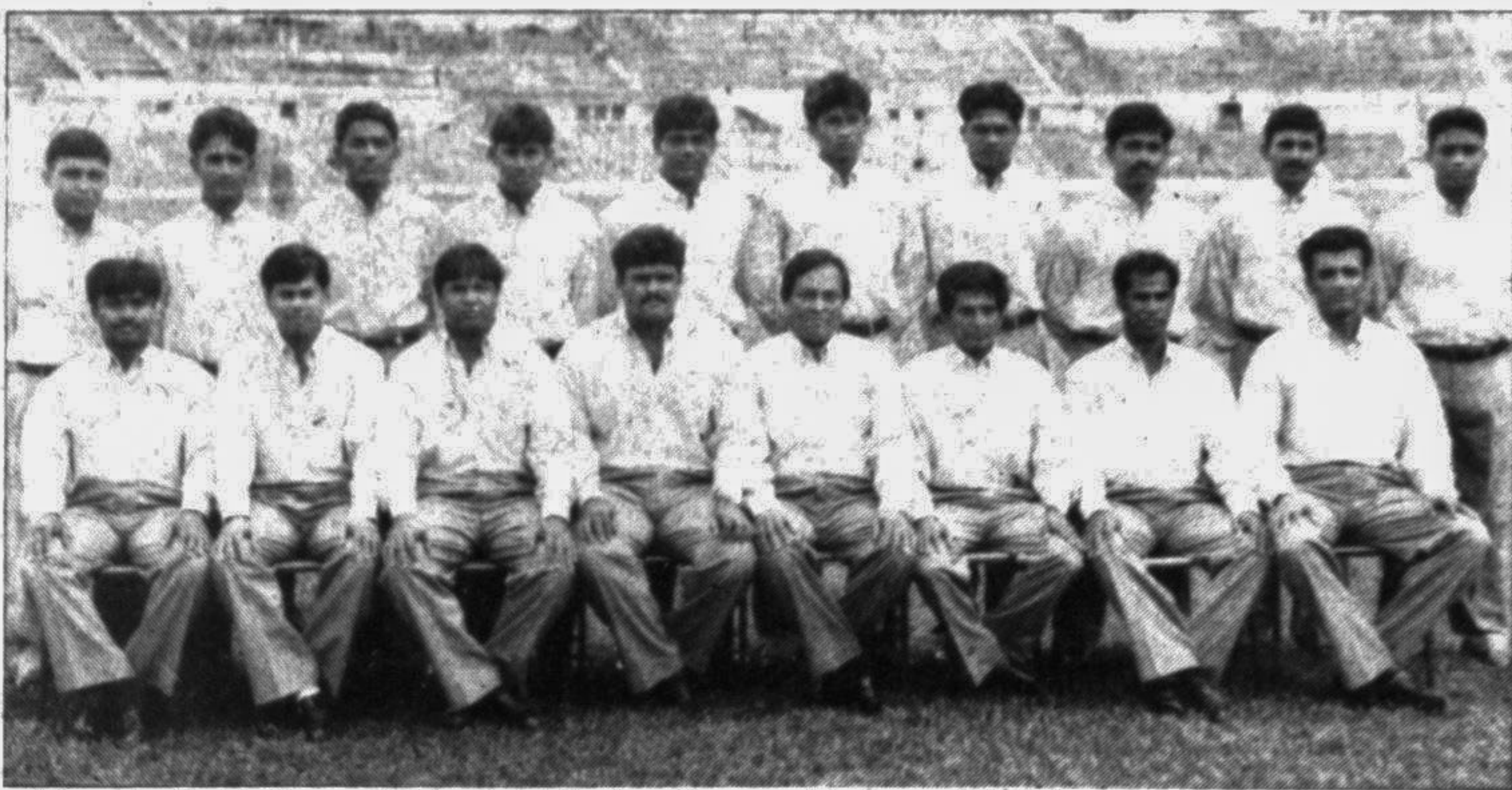
The national cricket team which is scheduled to leave for a month-long tour of North America early this morning posed at the Dhaka Stadium yesterday.