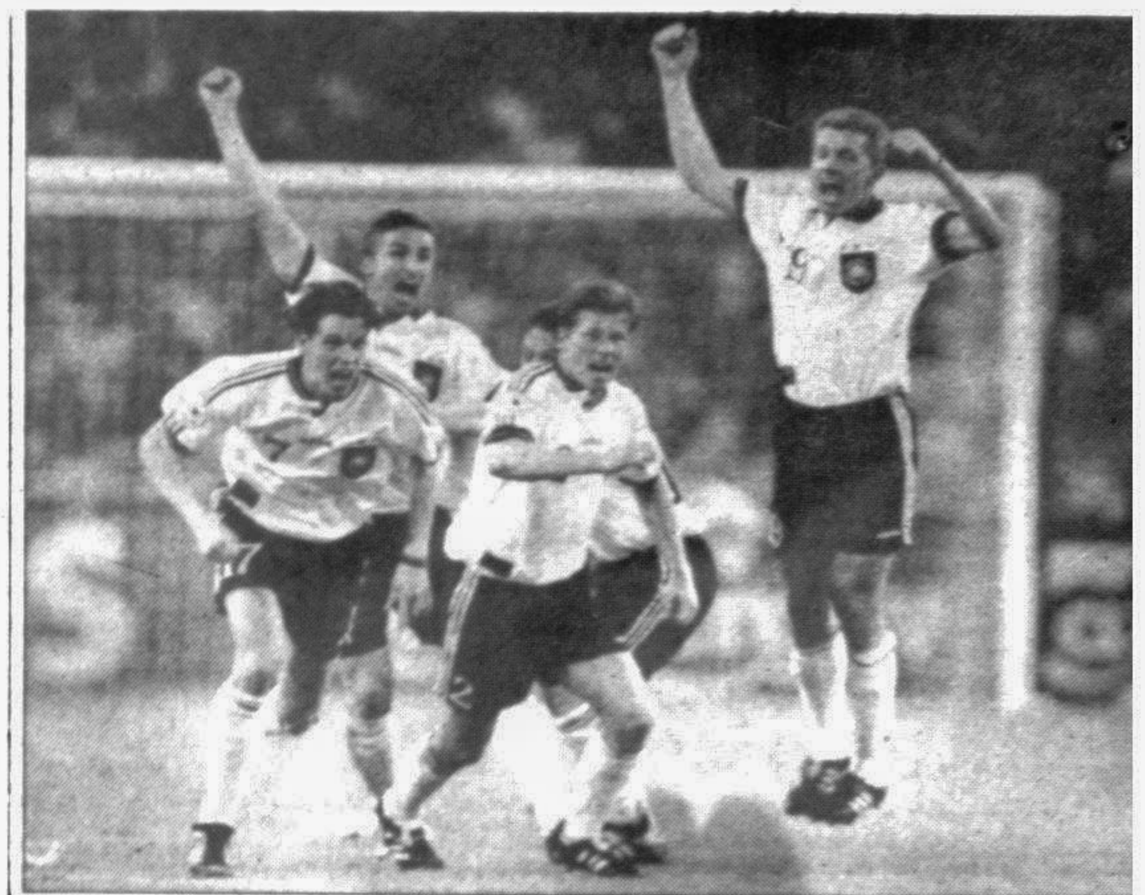
THE GALLANT GERMANS: (L to R) Christian Ziege, Stefan Kuntz, Stefan Reuter and Thomas Strunz are over the moon after edging bitter rivals England in the semifinals of the Euro '96 at Wembley on June 26.

BELFAST, June 27: English County side Sussex rattled up 384 from 60 overs on their way to trouncing Ireland by 304 runs in their one-day NatWest Trophy first round match on Wednesday, reports Reuter.